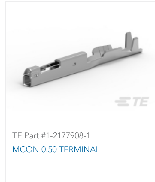
TE Part #1-2177908-1 MCON 0.50 TERMINAL