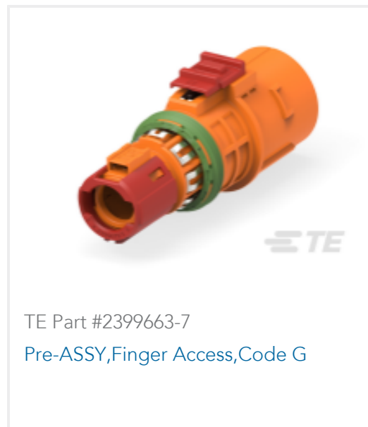
TE Part #2399663-7 Pre-ASSY, Finger Access, Code G