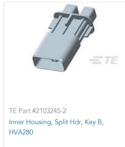
TE Part #2103245-2 Inner Housing, Split Hdr, Key B, HVA280