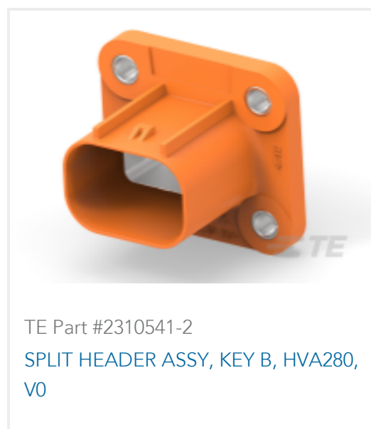
TE Part #2310541-2 SPLIT HEADER ASSY, KEY B, HVA280, V0