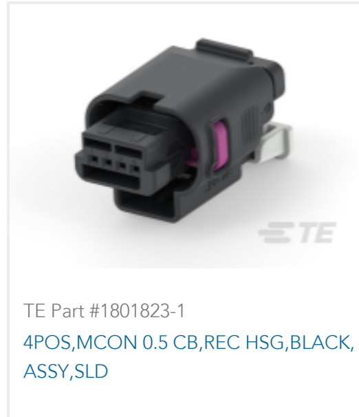
TE Part #1801823-1 4POS, MCON 0.5 CB, REC HSG, BLACK, ASSY, SLD