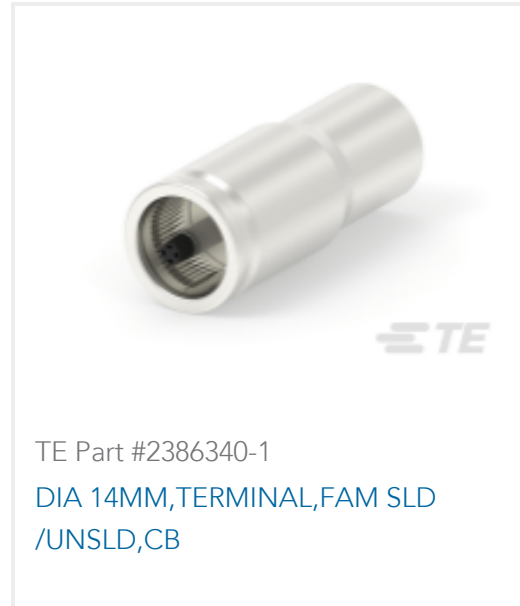
TE Part #2386340-1 DIA 14MM, TERMINAL, FAM SLD /UNSLD, CB