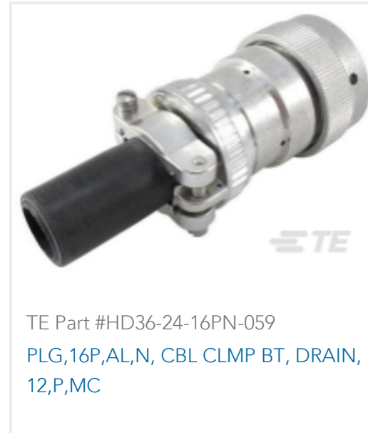
TE Part #HD36-24-16PN-059 PLG, 16P, AL, N, CBL CLMP BT, DRAIN, 12, P, MC