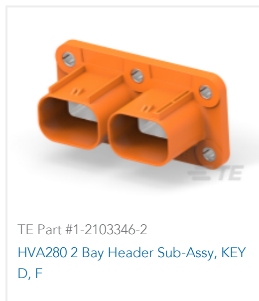
TE Part #1-2103346-2 HVA280 2 Bay Header Sub-Assy, KEY D, F