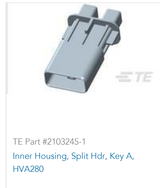
TE Part #2103245-1 Inner Housing, Split Hdr, Key A, HVA280