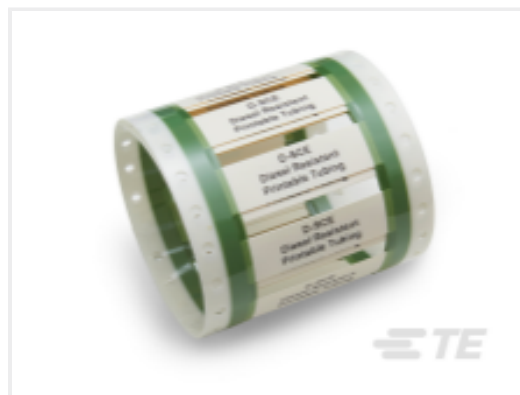
TE Part #CAT-T3437-D1 D-SCE Fluid Resistant Sleeves