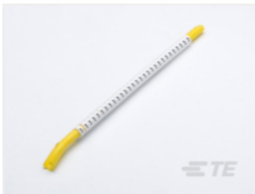
TE Part #CAT-T3437-ST2999 STD Snap-On Markers