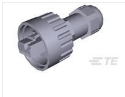
TE Part #1546440-1 ETHERNET FIELD ATTACHABL CONN