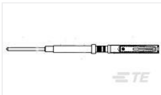
TE Part #1-211431-5 SKT, SZ 22, PST, SD, ARINC 600