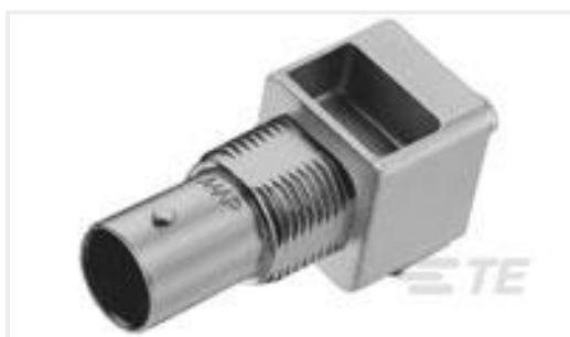
TE Part #6274127-1 JACK, PCB, 75 OHM, R/A, BNC