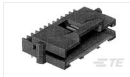
TE Part #5-104074-8 06 SYSTEM 50 HDR SRRA SHRD SN