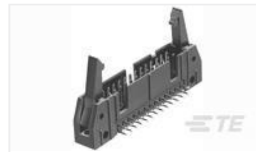
TE Part #5499913-3 A/L UNIV HDR 16P RA SHT LAT