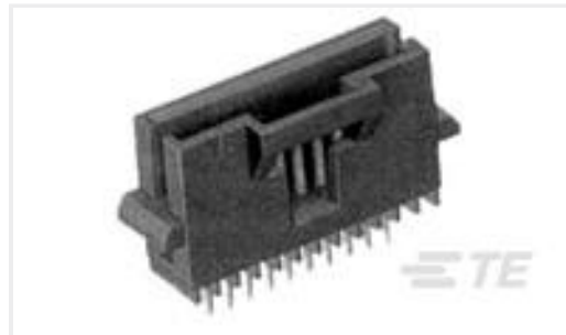
TE Part #5-104071-8 06 SYSTEM 50 HDR SRST SHRD SN