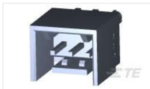
TE Part #2-644486-3 03P MTA100 SHRDED HDR ASSY SN