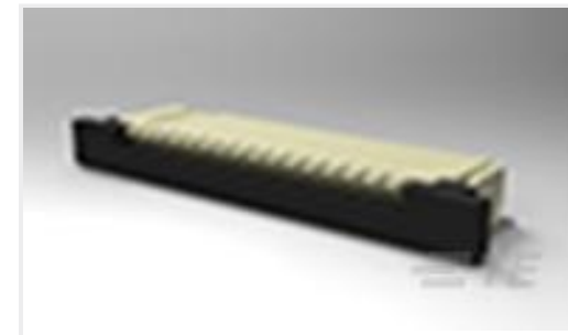
TE Part #84953-8 1MM FPC HORZ. TOP CONT. ASSY 8P