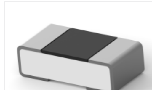
TE Part #3-2176363-6 RQ 0402 1K0 0.1% 10PPM 5K RL