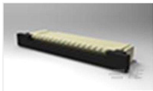
TE Part #1-84953-4 1MM FPC HORZ. TOP CONT. ASSY 14P