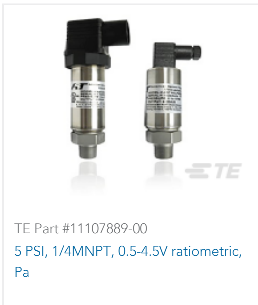
TE Part #11107889-00 5 PSI, 1/4MNPT, 0.5-4.5V ratiometric, Pa