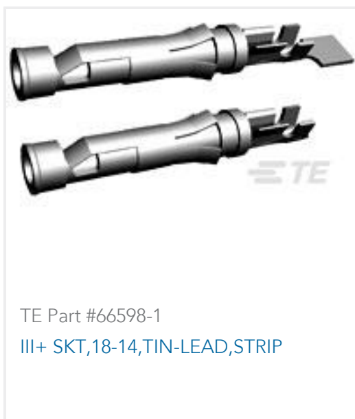
TE Part #66598-1 III+ SKT, 18-14, TIN-LEAD, STRIP