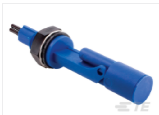
TE Part # 20017612-31 LDS309-11N Liquid Level Sensor