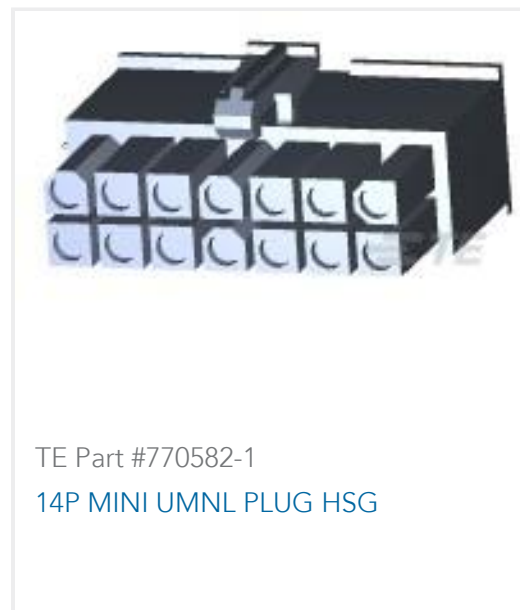
TE Part #770582-1 14P MINI UMNL PLUG HSG