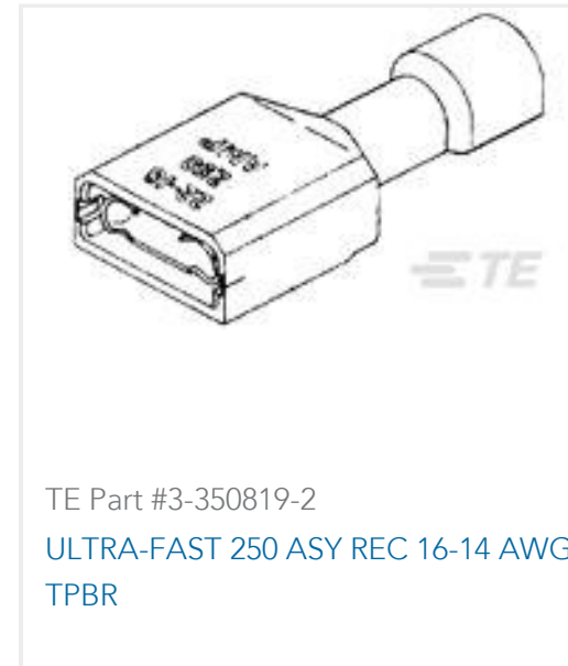
TE Part #3-350819-2 ULTRA-FAST 250 ASY REC 16-14 AWG TPBR