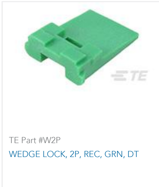
TE Part #W2P WEDGE LOCK, 2P, REC, GRN, DT