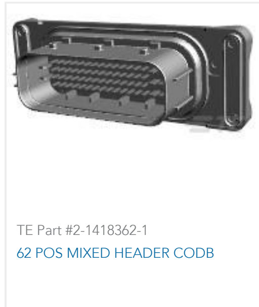
TE Part #2-1418362-1 62 POS MIXED HEADER CODB