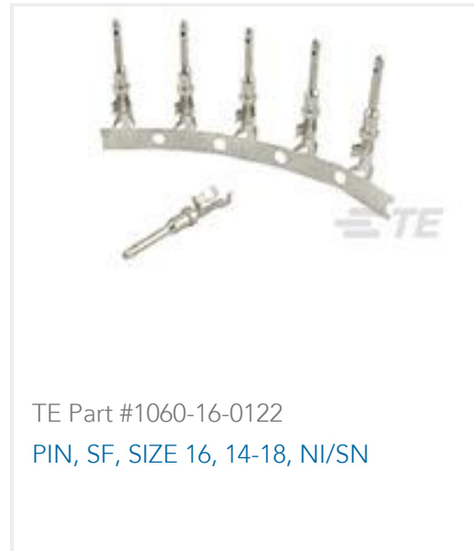
TE Part #1060-16-0122 PIN, SF, SIZE 16, 14-18, NI/SN