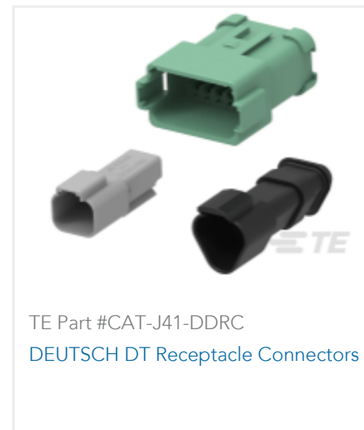
TE Part #CAT-J41-DDRC DEUTSCH DT Receptacle Connectors