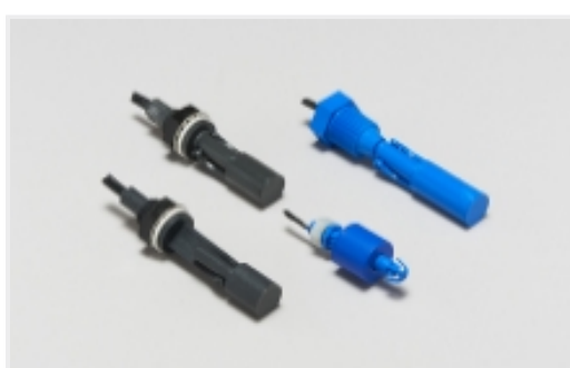
Liquid Level Switches(1)