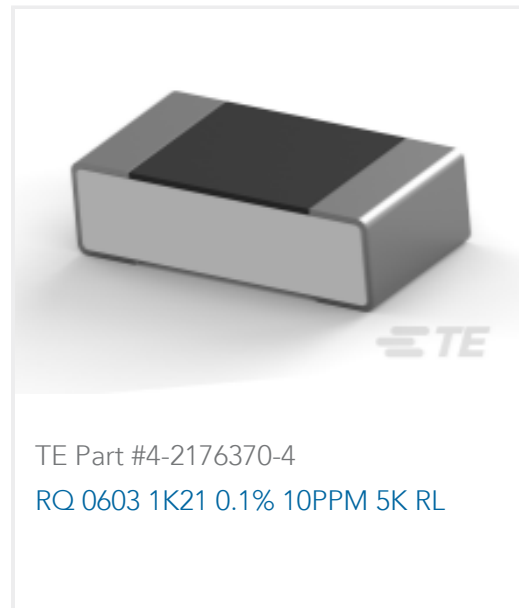
TE Part #4-2176370-4 RQ 0603 1K21 0.1% 10PPM 5K RL