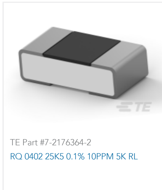
TE Part #7-2176364-2 RQ 0402 25K5 0.1% 10PPM 5K RL