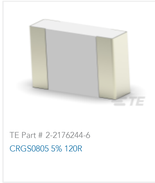
TE Part # 2-2176244-6 CRGS0805 5% 120R