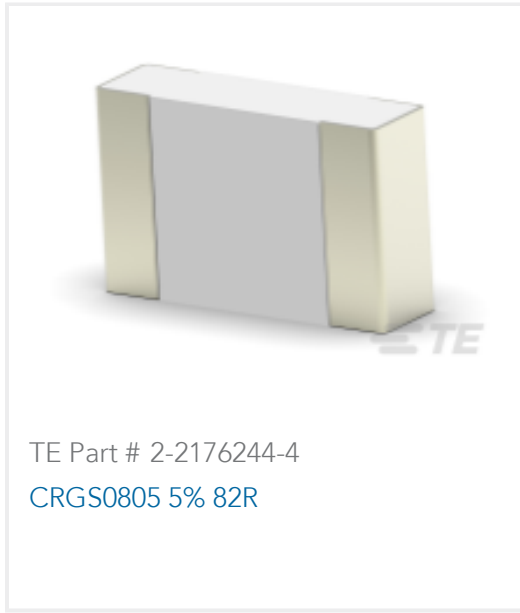
TE Part # 2-2176244-4 CRGS0805 5% 82R