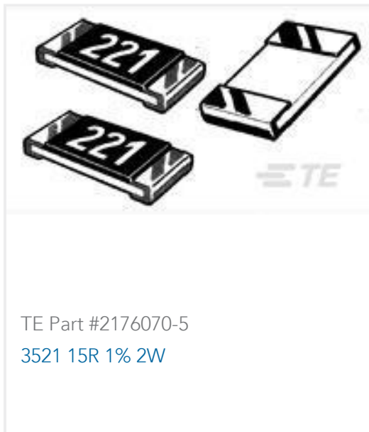
TE Part #2176070-5 3521 15R 1% 2W