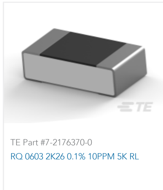
TE Part #7-2176370-0 RQ 0603 2K26 0.1% 10PPM 5K RL