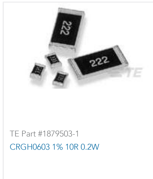
TE Part #1879503-1 CRGH0603 1% 10R 0.2W