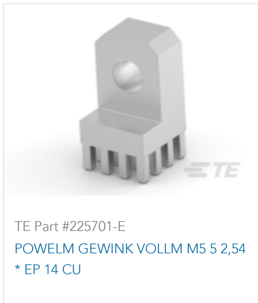
TE Part #225701-E POWELM GEWINK VOLLM M5 5 2,54 * EP 14 CU