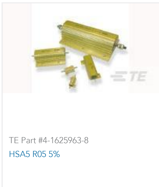
TE Part #4-1625963-8 HSA5 R05 5%