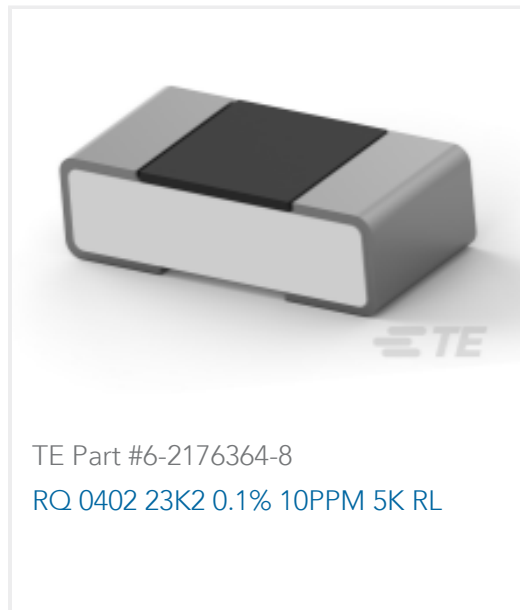
TE Part #6-2176364-8 RQ 0402 23K2 0.1% 10PPM 5K RL