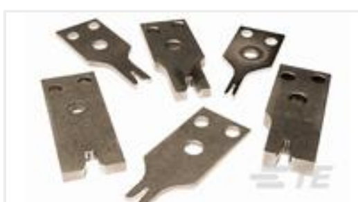
TE Part #1-456404-6 CRIMPER WIRE .070 F