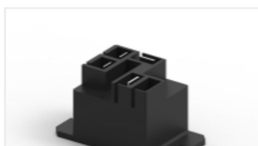
TE Part #1649341-8 T9CP1A54-24