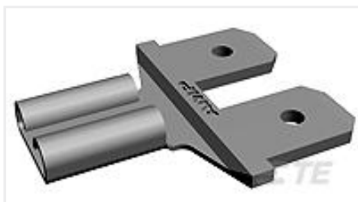
TE Part #61045-2 FASTON .187 SERIES (4.8 MM) TPBR