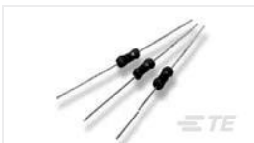
TE Part #6-1879350-3 RR01 5% 82R AMMO