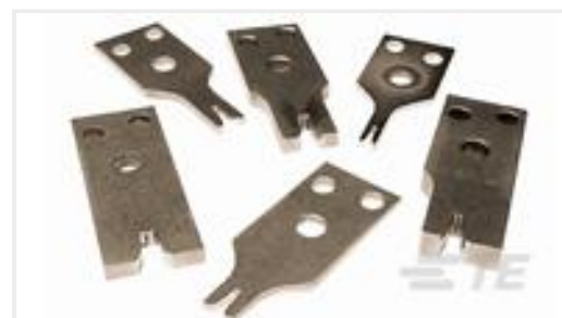
TE Part #456411-9 CRIMPER WIRE .140 F