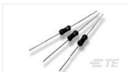
TE Part #3-1879355-0 RR03 5% 68K AMMO