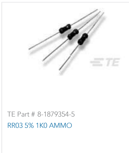
TE Part # 8-1879354-5 RR03 5% 1K0 AMMO