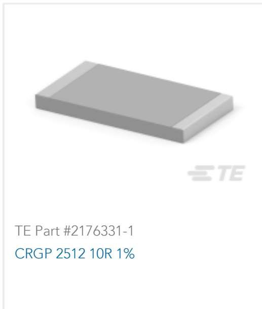
TE Part #2176331-1 CRGP 2512 10R 1%