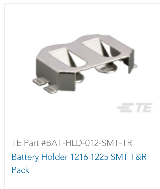
TE Part #BAT-HLD-012-SMT-TR Battery Holder 1216 1225 SMT T&R Pack