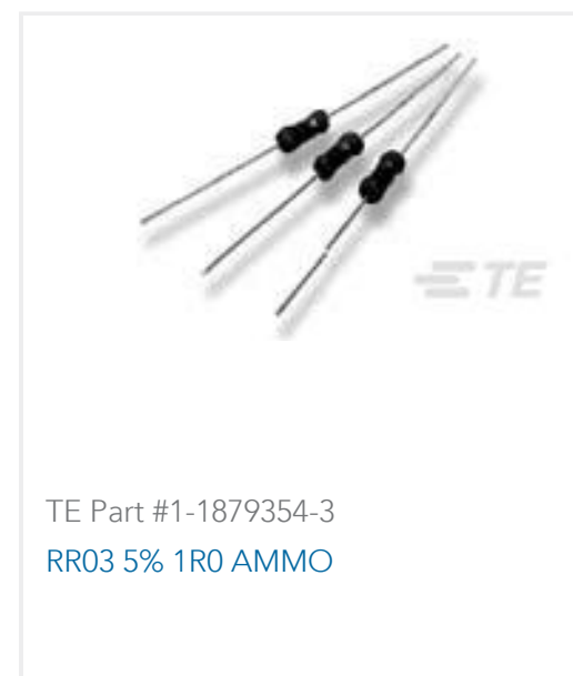
TE Part #1-1879354-3 RR03 5% 1R0 AMMO