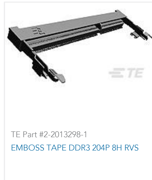
TE Part #2-2013298-1 EMBOSS TAPE DDR3 204P 8H RVS