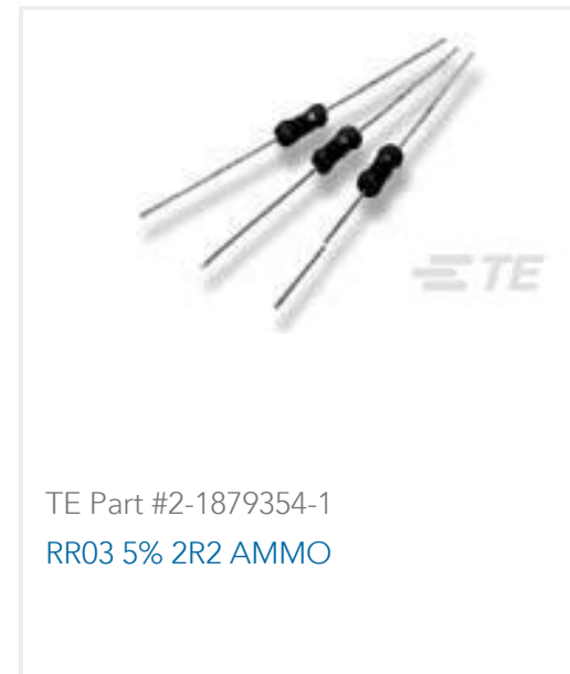
TE Part #2-1879354-1 RR03 5% 2R2 AMMO