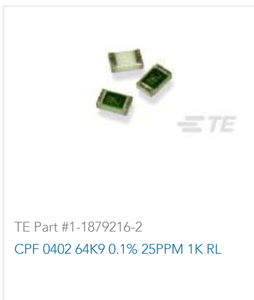
TE Part #1-1879216-2 CPF 0402 64K9 0.1% 25PPM 1K RL