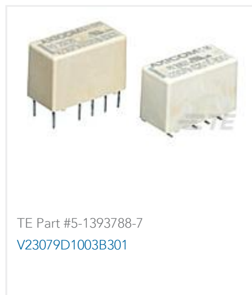
TE Part #5-1393788-7 V23079D1003B301