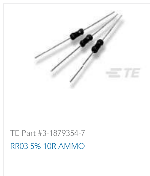
TE Part #3-1879354-7 RR03 5% 10R AMMO