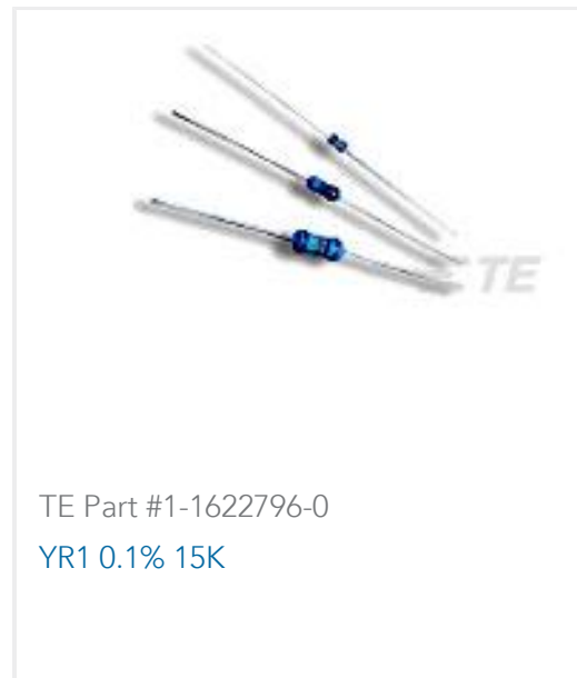
TE Part #1-1622796-0 YR1 0.1% 15K