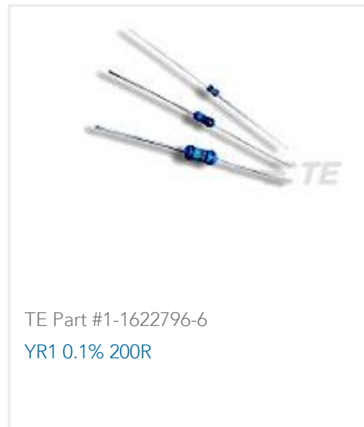
TE Part #1-1622796-6 YR1 0.1% 200R