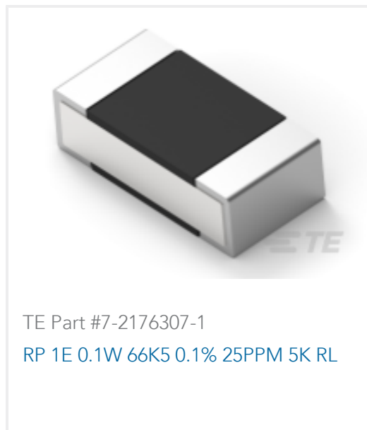
TE Part #7-2176307-1 RP 1E 0.1W 66K5 0.1% 25PPM 5K RL