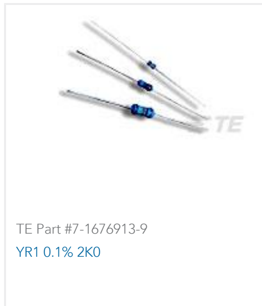
TE Part #7-1676913-9 YR1 0.1% 2K0