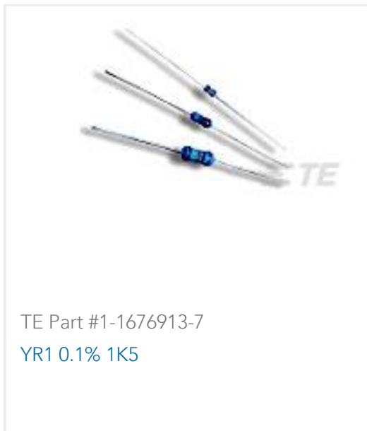
TE Part #1-1676913-7 YR1 0.1% 1K5