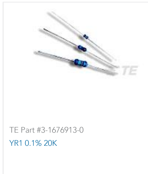
TE Part #3-1676913-0 YR1 0.1% 20K