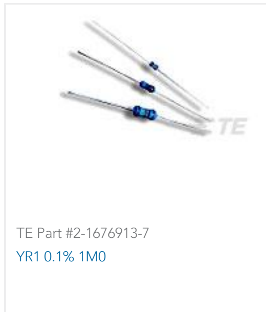
TE Part #2-1676913-7 YR1 0.1% 1M0