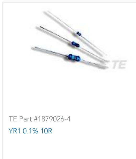
TE Part #1879026-4 YR1 0.1% 10R