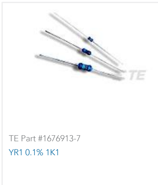
TE Part #1676913-7 YR1 0.1% 1K1