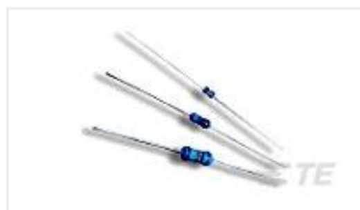
TE Part #1-1622796-5 YR1 0.1% 200K