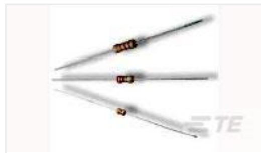
TE Part # 2-1623929-2 CFR200 5% 22K