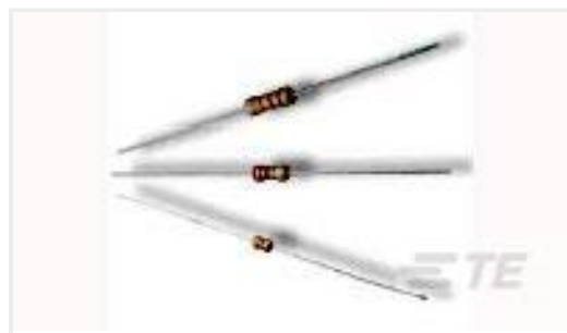
TE Part # 1623930-3 CFR25 5% 10K