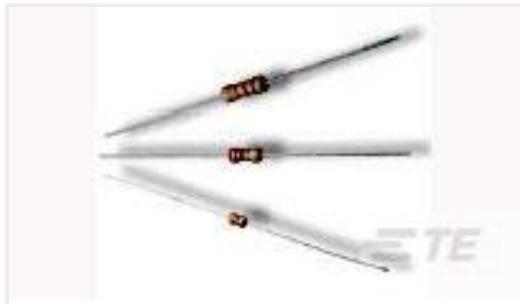
TE Part # 1623925-2 CFR100 5% 100R