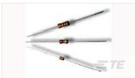
TE Part #1623927-1 CFR16 5% 100K