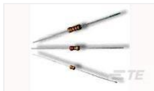
TE Part #1-1623932-1 CFR50 5% 10R