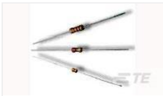
TE Part # 1623927-8 CFR16 5% 120R