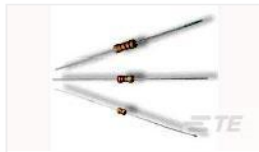
TE Part # 1623932-8 CFR50 5% 10K