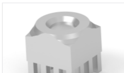
TE Part #225689-E POWELM BUCHSE RUNDM M5 6 2,54 * EP 6 CUS