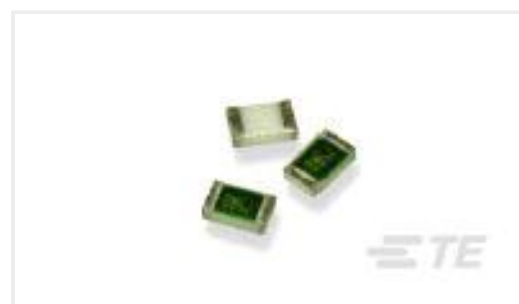
TE Part #9-1879208-7 CPF 0402 100K 0.1% 25PPM 1K RL