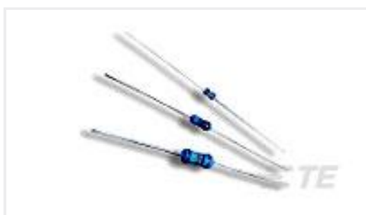
TE Part #1622519-1 LR1 1% 56K