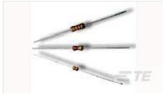
TE Part # 1623925-2 CFR100 5% 100R