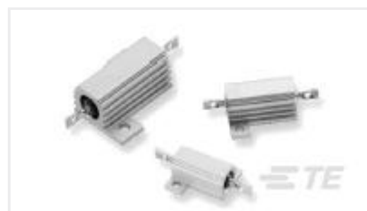
TE Part #2-1879074-8 THS15 100R 5%