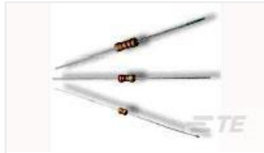
TE Part # 1623927-8 CFR16 5% 120R