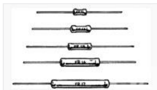
TE Part #8-1623746-6 ER74 R33 10% AMMO PK