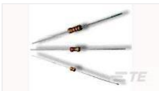
TE Part #4-1623925-2 CFR100 5% 4K7