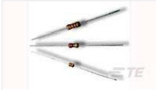
TE Part # 1623932-8 CFR50 5% 10K