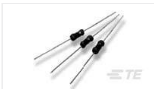
TE Part #2-1625886-9 1W SM M/OX 5% 5K6