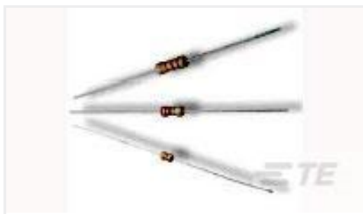
TE Part #4-1623932-5 CFR50 5% 1M0