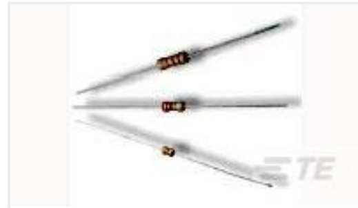
TE Part # 2-1623929-2 CFR200 5% 22K