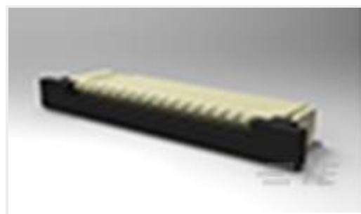
TE Part #84953-7 1MM FPC HORZ.TOP CONT.ASSY 7P