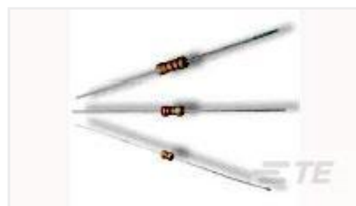
TE Part #1623925-3 CFR100 5% 10K