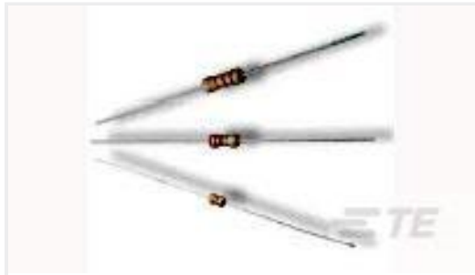
TE Part # 1623930-3 CFR25 5% 10K