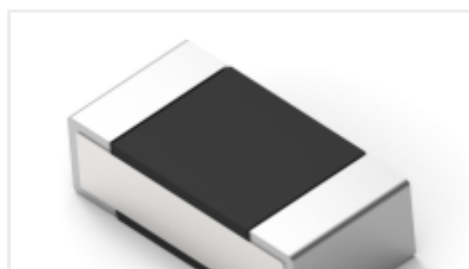
TE Part #9-2176310-4 RP 1E 0.1W 1K0 0.1% 25PPM 1K RL