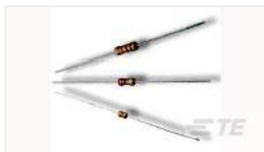
TE Part #1623925-1 CFR100 5% 100K