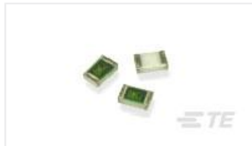
TE Part #1676143-2 RN 0805 100R 0.1% 10PPM 1KRL