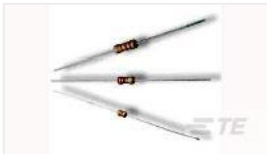
TE Part #1-1623925-9 CFR100 5% 1M0