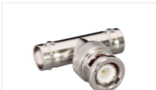
TE Part #ADP-BNCFM-BNCF-T BNC Plug to BNC Jack (2) Tee