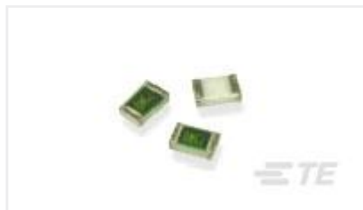
TE Part #1676354-2 RN 0805 4K02 0.1% 10PPM 1KRL