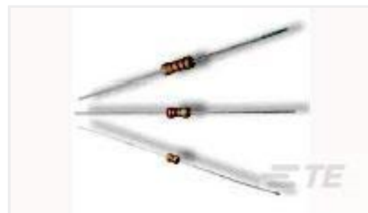
TE Part #1623925-3 CFR100 5% 10K