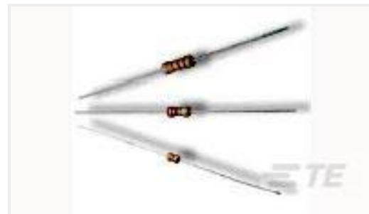
TE Part #4-1623925-0 CFR100 5% 47K