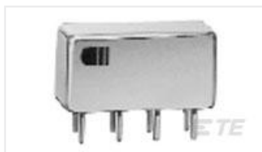
TE Part #1-1617029-1 HFW1130K06 = M39016/6-104L