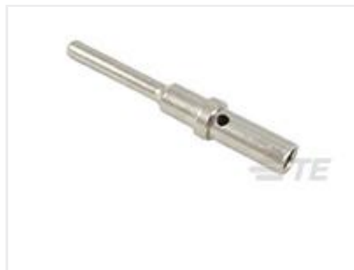
TE Part #0460-202-16141 PIN, SOLID, SIZE 16, 16-20AWG, NI