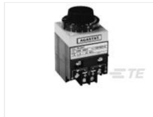
TE Part #1-1423162-8 7022AK=RLY,STD,OFF,2P,120VAC,1