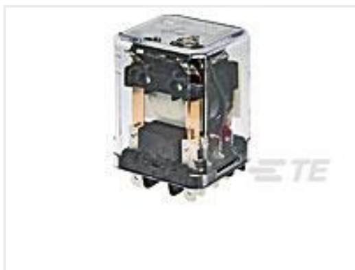
TE Part #4-2027183-3 KUPE-11D15-125=RELAY,3A,2C, AGCDO,QC.187,