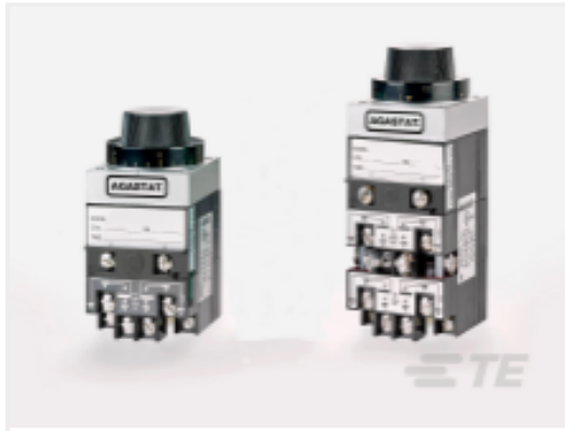
TE Part # 2-1423159-3 7012PC=RLY,STD,ON,2P,125VDC,15