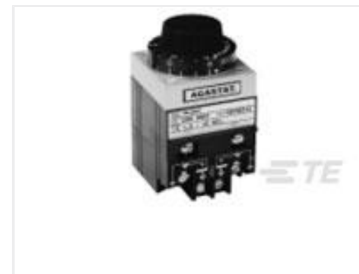
TE Part #1423162-2 7022AB=RLY,STD,OFF,2P,120VAC,5