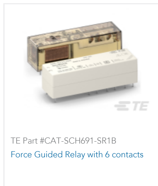
TE Part #CAT-SCH691-SR1B Force Guided Relay with 6 contacts