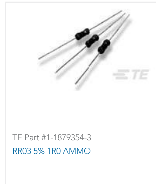
TE Part #1-1879354-3 RR03 5% 1R0 AMMO