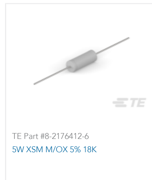
TE Part #8-2176412-6 5W XSM M/OX 5% 18K