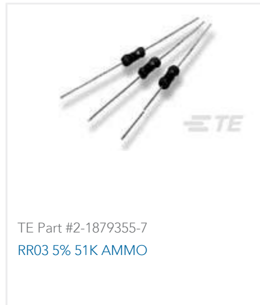
TE Part #2-1879355-7 RR03 5% 51K AMMO