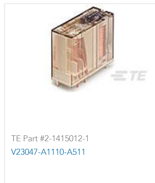
TE Part #2-1415012-1 V23047-A1110-A511