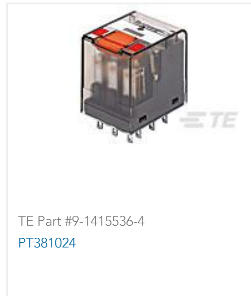
TE Part #9-1415536-4 PT381024