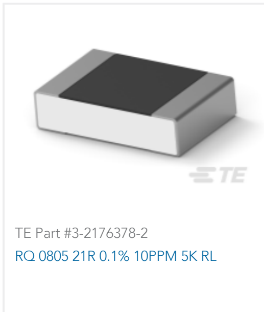
TE Part #3-2176378-2 RQ 0805 21R 0.1% 10PPM 5K RL