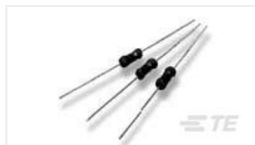
TE Part #6-1879352-1 RR02 5% 100R AMMO