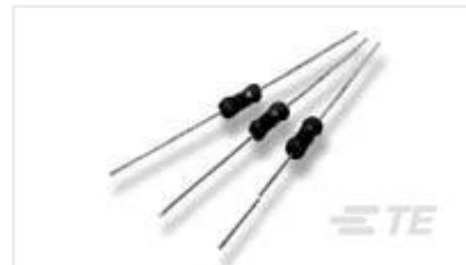
TE Part #8-1879350-0 RR01 5% 430R AMMO