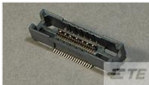
TE Part #5767061-1 MICT,RECPT,038,ASSY,093,PDNI