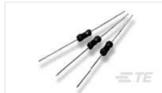
TE Part #3-1879355-4 RR03 5% 100K AMMO