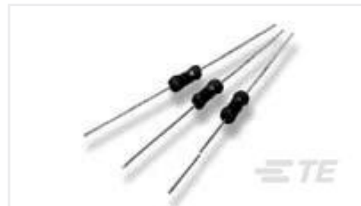
TE Part #7-1879352-6 RR02 5% 430R AMMO