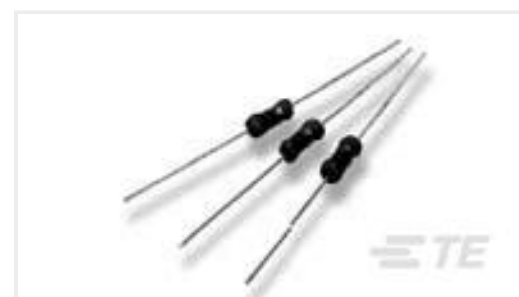
TE Part #7-1879350-3 RR01 5% 220R AMMO