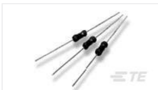
TE Part #7-1879352-2 RR02 5% 300R AMMO