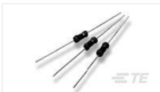
TE Part #1879353-2 RR02 5% 4K7 AMMO