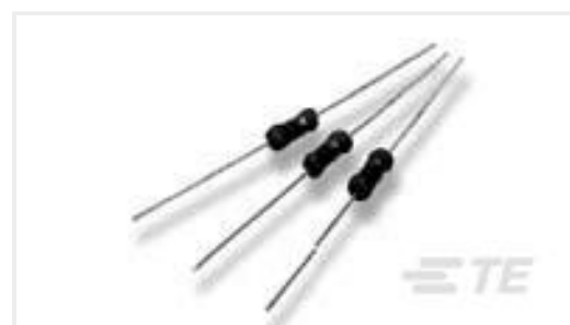
TE Part #1-1879353-0 RR02 5% 10K AMMO