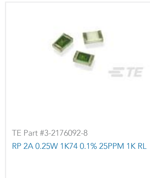
TE Part #3-2176092-8 RP 2A 0.25W 1K74 0.1% 25PPM 1K RL