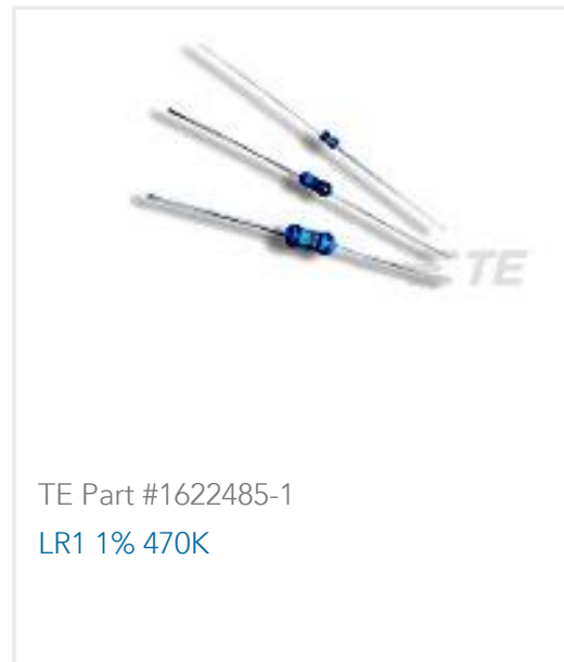
TE Part #1622485-1 LR1 1% 470K