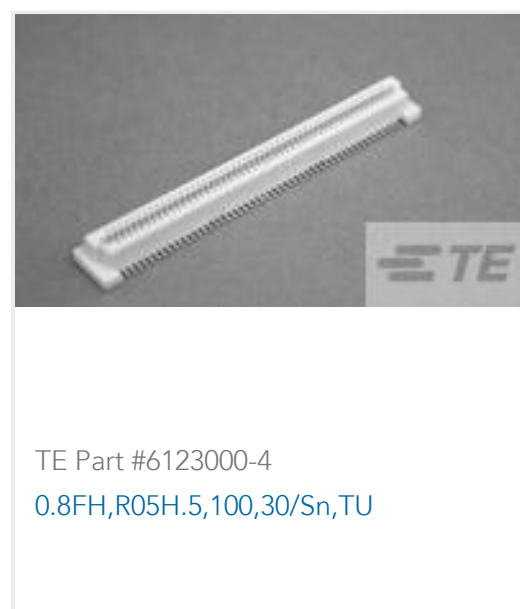
TE Part #6123000-4 0.8FH,R05H.5,100,30/Sn,TU