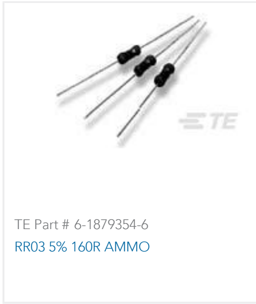
TE Part # 6-1879354-6 RR03 5% 160R AMMO