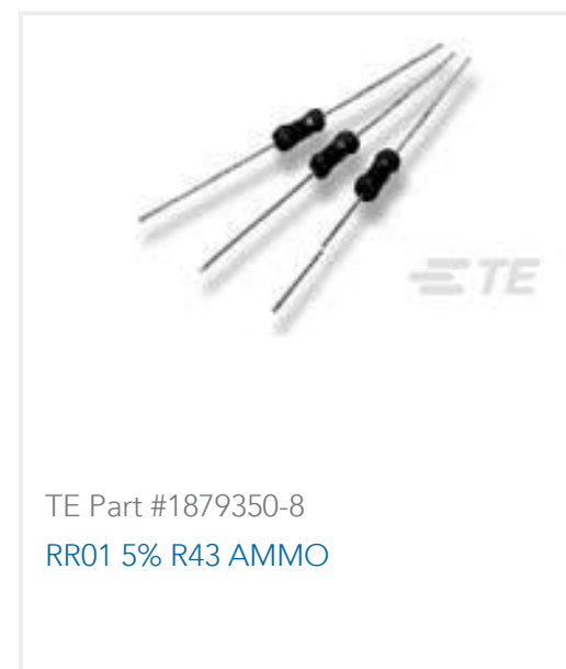
TE Part #1879350-8 RR01 5% R43 AMMO