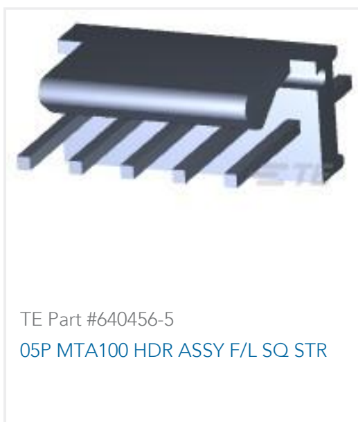
TE Part #640456-5 05P MTA100 HDR ASSY F/L SQ STR