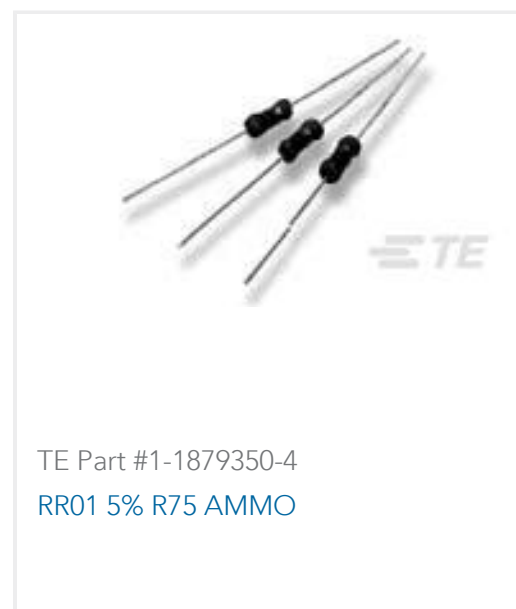
TE Part #1-1879350-4 RR01 5% R75 AMMO