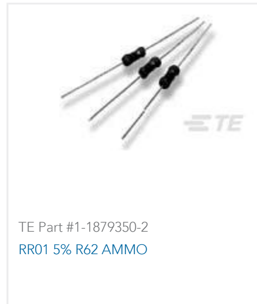
TE Part #1-1879350-2 RR01 5% R62 AMMO