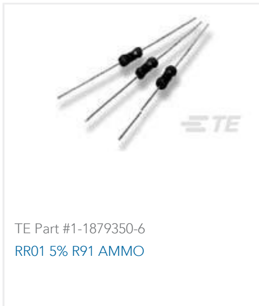
TE Part #1-1879350-6 RR01 5% R91 AMMO