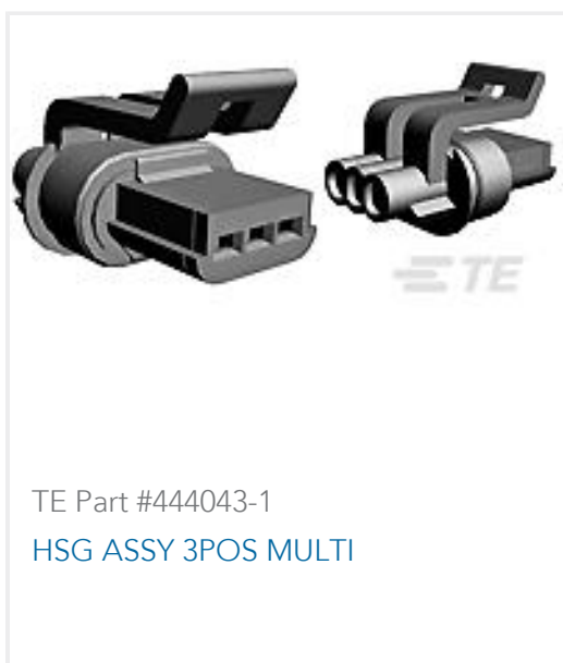
TE Part #444043-1 HSG ASSY 3POS MULTI