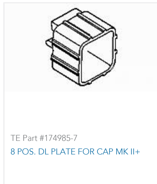
TE Part #174985-7 8 POS. DL PLATE FOR CAP MK II+