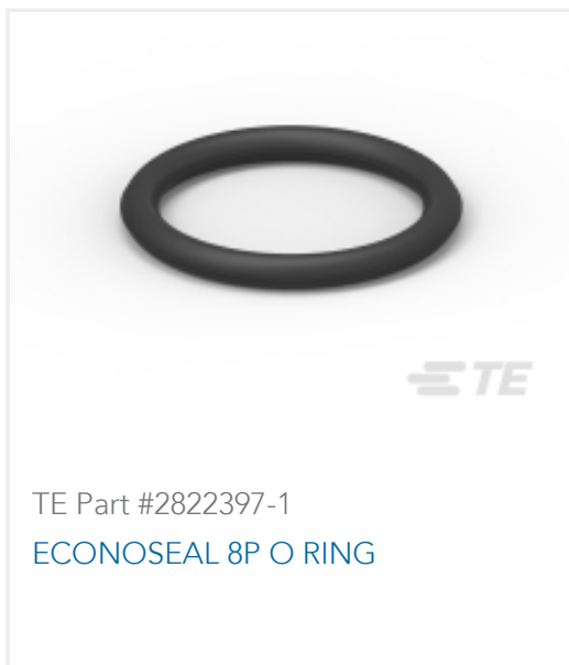
TE Part #2822397-1 ECONOSEAL 8P O RING