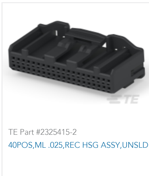
TE Part #2325415-2 40POS,ML .025,REC HSG ASSY,UNSLD