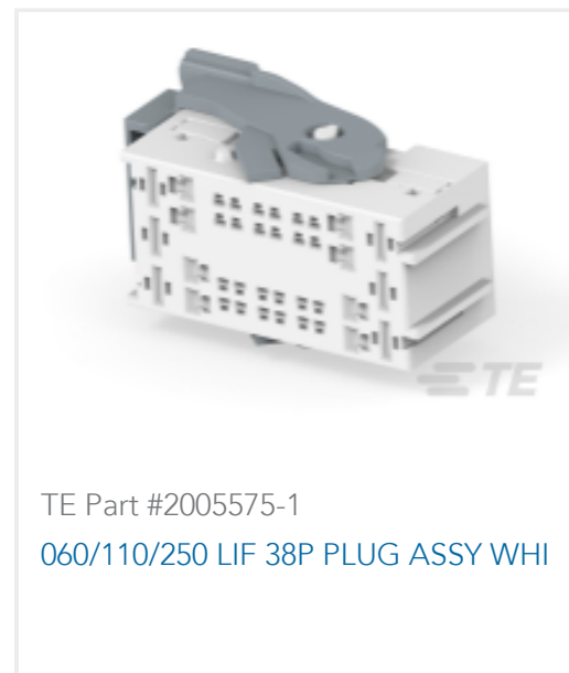
TE Part #2005575-1 060/110/250 LIF 38P PLUG ASSY WHI