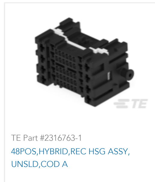
TE Part #2316763-1 48POS,HYBRID,REC HSG ASSY, UNSLD,COD A