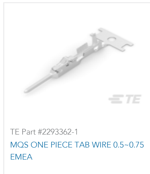
TE Part #2293362-1 MQS ONE PIECE TAB WIRE 0.5~0.75 EMEA