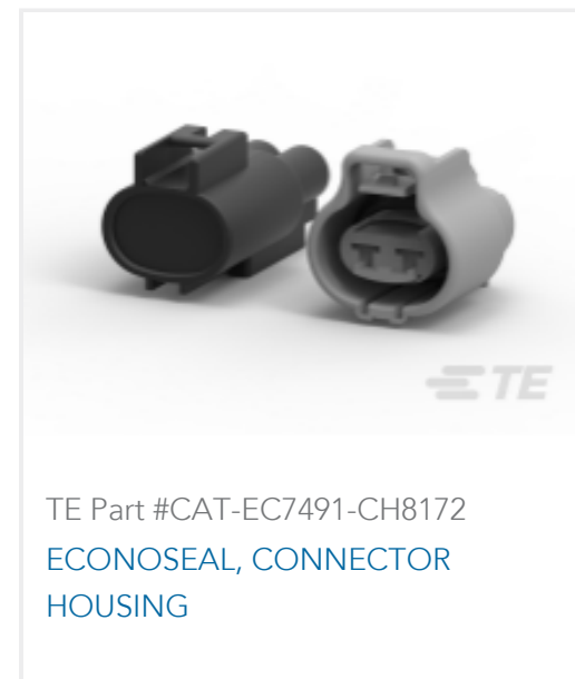
TE Part #CAT-EC7491-CH8172 ECONOSEAL, CONNECTOR HOUSING