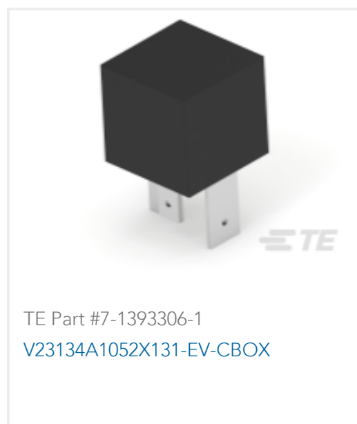
TE Part #7-1393306-1 V23134A1052X131-EV-CBOX