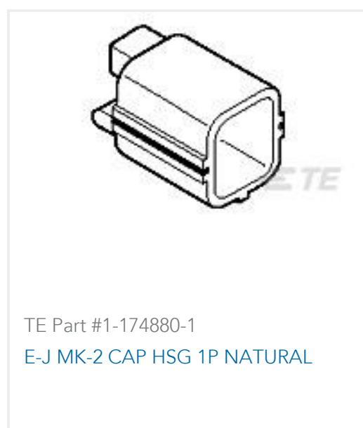
TE Part #1-174880-1 E-J MK-2 CAP HSG 1P NATURAL