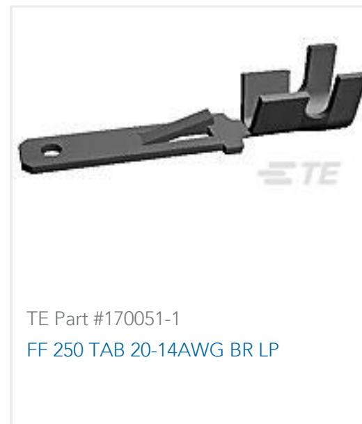
TE Part #170051-1 FF 250 TAB 20-14AWG BR LP