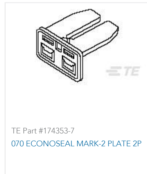
TE Part #174353-7 070 ECONOSEAL MARK-2 PLATE 2P