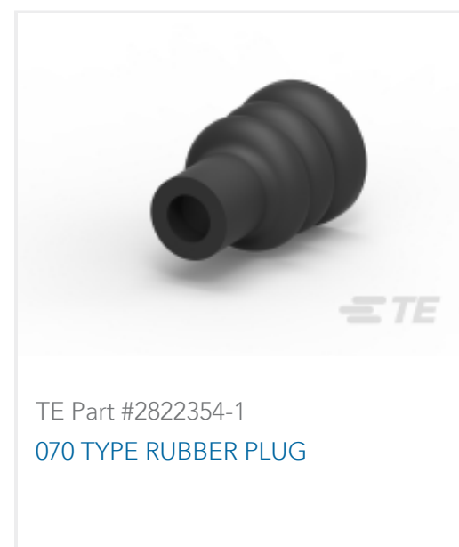
TE Part #2822354-1 070 TYPE RUBBER PLUG