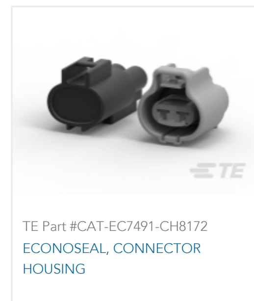
TE Part #CAT-EC7491-CH8172 ECONOSEAL, CONNECTOR HOUSING