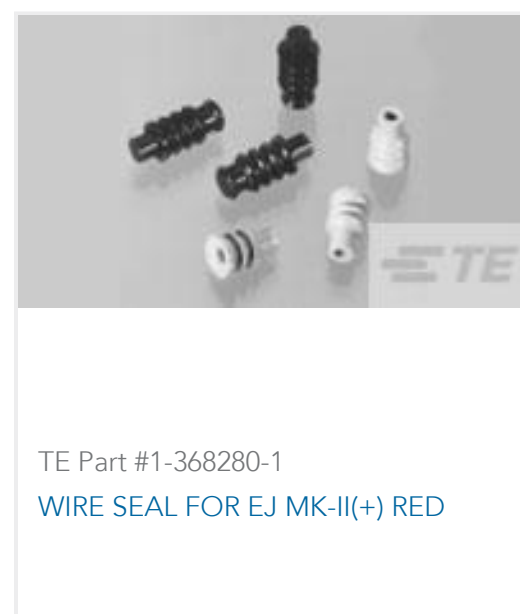
TE Part #1-368280-1 WIRE SEAL FOR EJ MK-II(+) RED