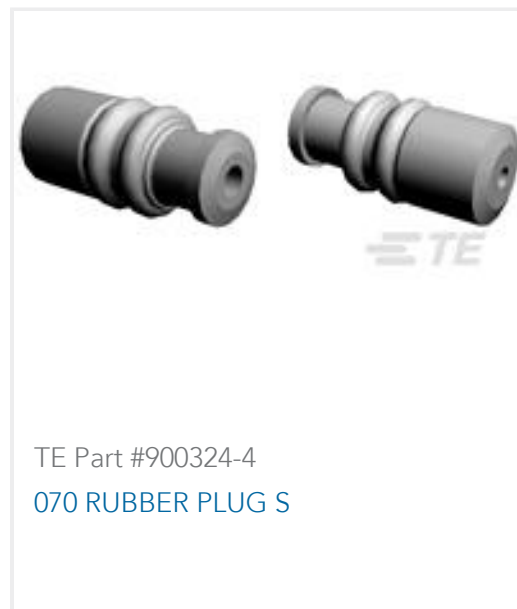
TE Part #900324-4 070 RUBBER PLUG S