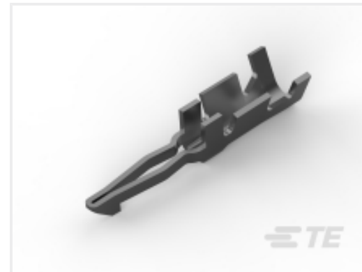
TE Part # 172781-3 LOW PROFILE MINI AMP-IN (AWG#30-#26)X-TY