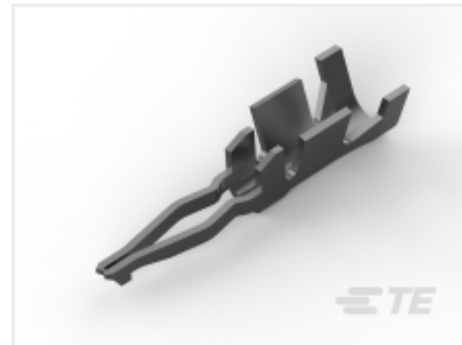
TE Part # 172782-7 LOW PROFILE MINI AMP-IN