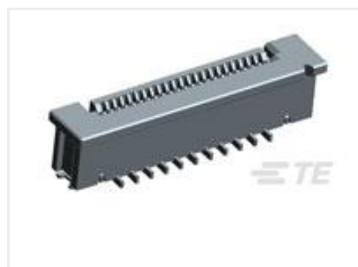
TE Part #1-1734742-2 .5 FPC VT ZIF Type-A 12 CONT