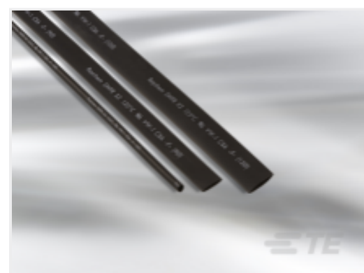
TE Part #EM7503-000 X4-2.5-0-SP-SM