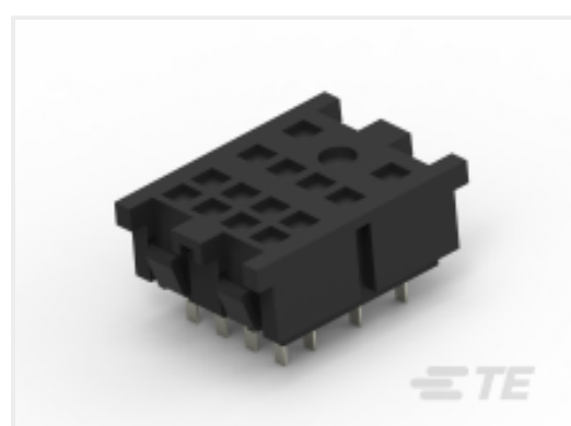
TE Part #1419106-3 27E023=SOCKET,KH,14,PCB,PHEN,BL