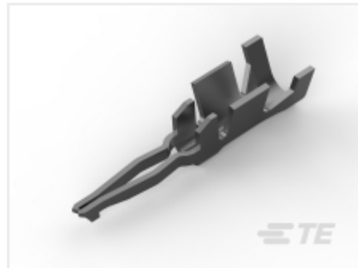
TE Part # 172782-5 LOW PROFILE MINI AMP-IN