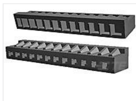
TE Part #172520-4 LOW PRO MINI AMP-IN HDR 4P