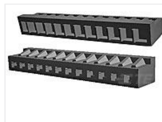
TE Part #172520-8 8P 2.5MM MINI AMP-IN HDR HSG