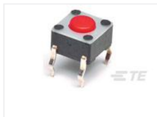
TE Part #3-1825910-2 FSM16JAH=6MM TACT SWITCH, HIGH TEMP