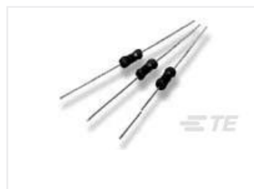
TE Part #7-1625892-9 3W SM M/OX 5% 8R2