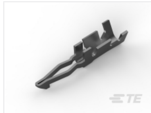
TE Part # 172781-4 LOW PROFILE MINI AMP-IN (AWG#30-#26)Y-TY