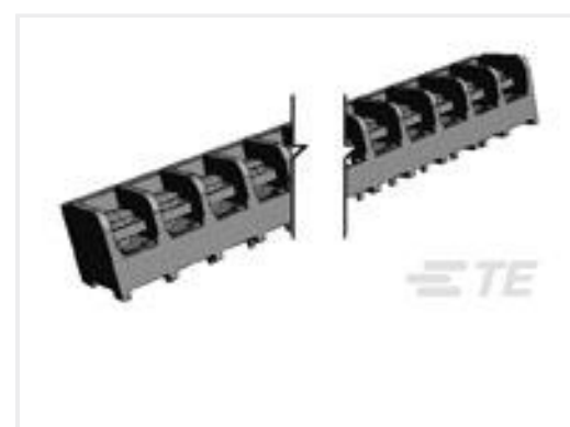
TE Part #8-1437653-0 6PCV-16-006=6PCV ASSEMBLY