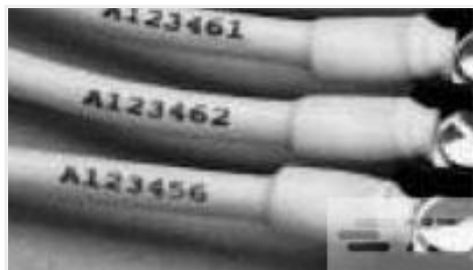
TE Part #5054202007 RNF-100-1/2-1-STK