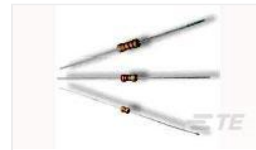
TE Part # 1623927-8 CFR16 5% 120R