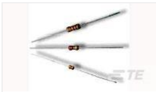
TE Part # 1623925-2 CFR100 5% 100R