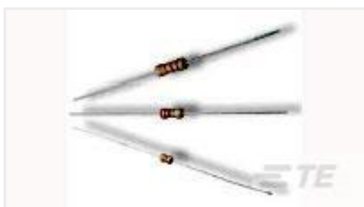
TE Part #3-1623925-9 CFR100 5% 470R