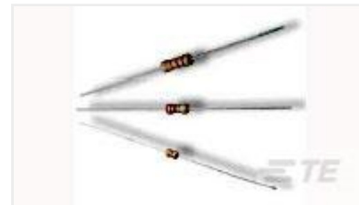
TE Part #1623933-8 CFR50 5% 360R