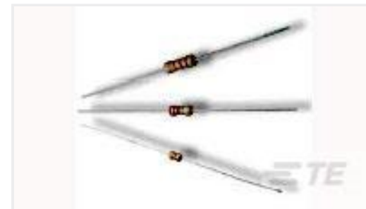
TE Part #2-1623925-1 CFR100 5% 220K