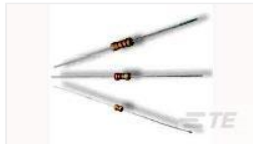
TE Part #1623925-1 CFR100 5% 100K