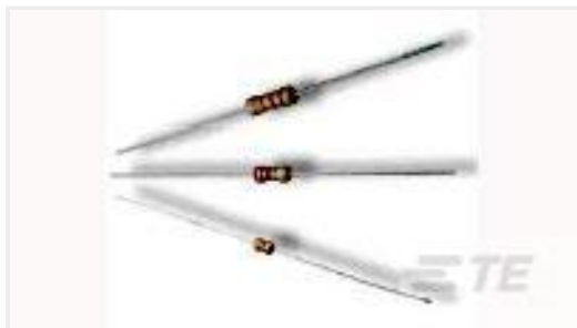
TE Part #4-1623925-0 CFR100 5% 47K