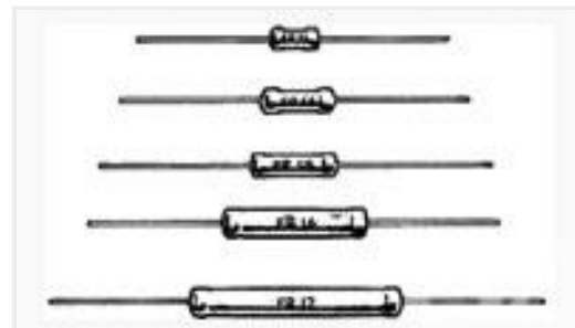
TE Part #1623746-5 ER74 12R 5% AMMO PK