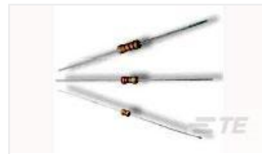
TE Part # 1623932-8 CFR50 5% 10K