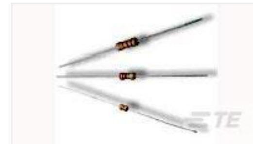
TE Part #2-1623925-7 CFR100 5% 2K2