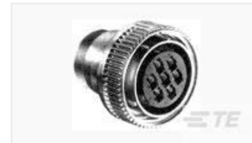
TE Part #208482-1 CMC PLUG ASSEMBLY,SZ 28