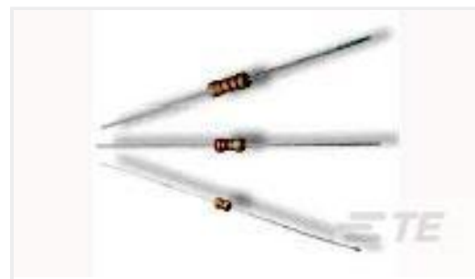
TE Part # 1623930-3 CFR25 5% 10K