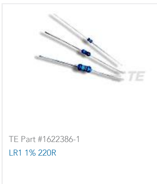
TE Part #1622386-1 LR1 1% 220R