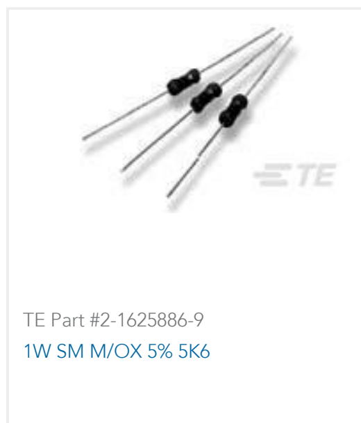
TE Part #2-1625886-9 1W SM M/OX 5% 5K6