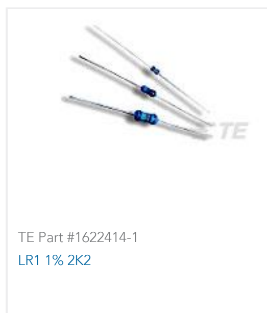
TE Part #1622414-1 LR1 1% 2K2