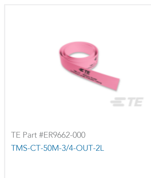
TE Part #ER9662-000 TMS-CT-50M-3/4-OUT-2L