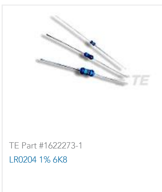
TE Part #1622273-1 LR0204 1% 6K8