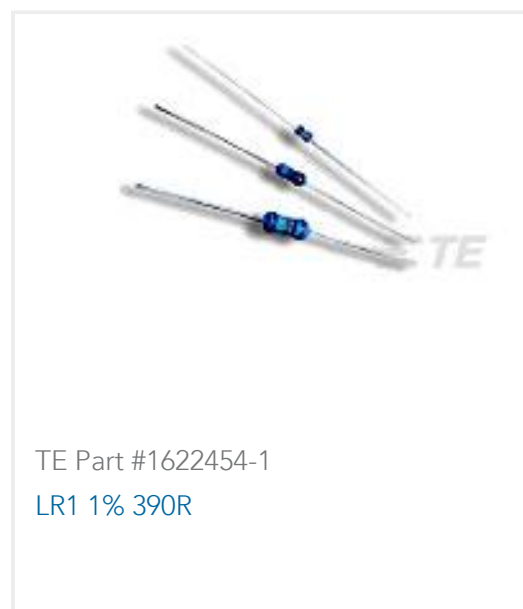
TE Part #1622454-1 LR1 1% 390R