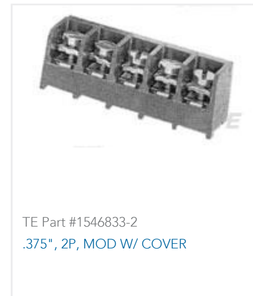
TE Part #1546833-2 .375", 2P, MOD W/ COVER