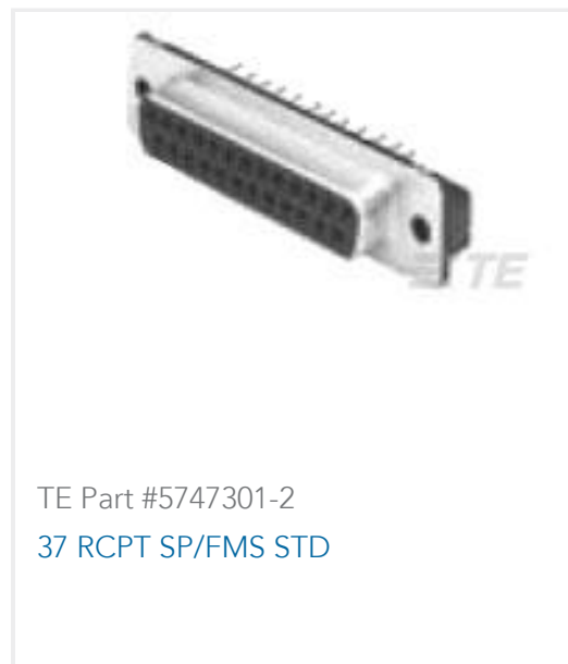
TE Part #5747301-2 37 RCPT SP/FMS STD