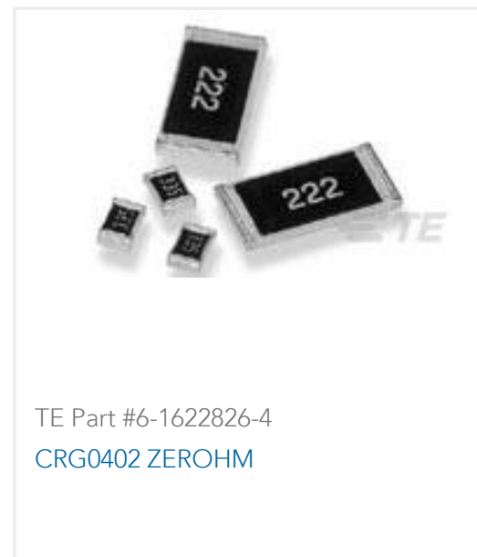
TE Part #6-1622826-4 CRG0402 ZEROHM