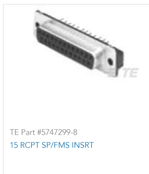
TE Part #5747299-8 15 RCPT SP/FMS INSRT