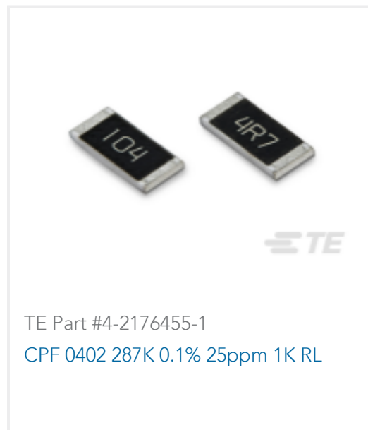
TE Part #4-2176455-1 CPF 0402 287K 0.1% 25ppm 1K RL