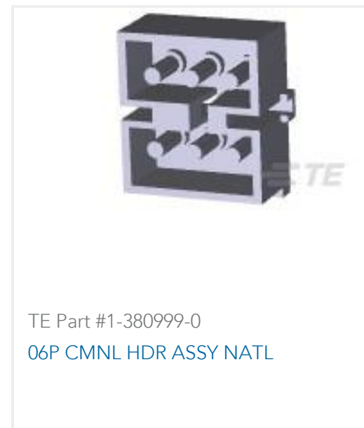
TE Part #1-380999-0 06P CMNL HDR ASSY NATL