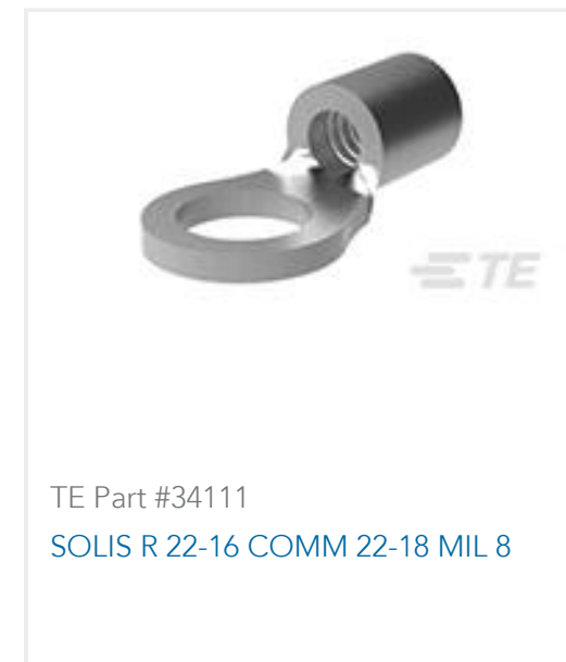
TE Part #34111 SOLIS R 22-16 COMM 22-18 MIL 8