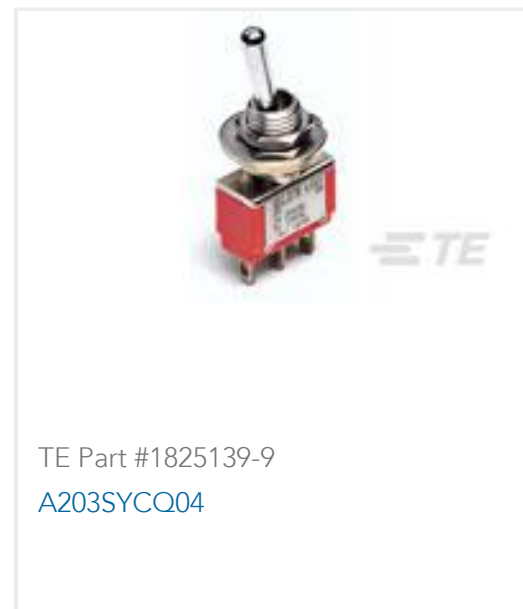
TE Part #1825139-9 A203SYCQ04