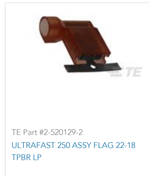
TE Part #2-520129-2 ULTRAFast 250 ASSY FLAG 22-18 TPBR LP