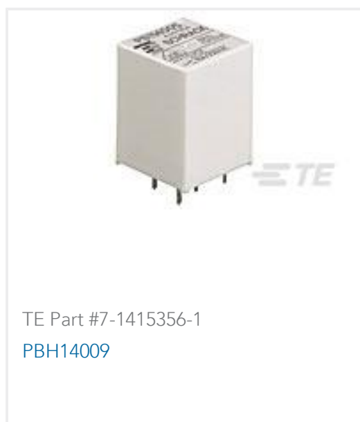
TE Part #7-1415356-1 PBH14009