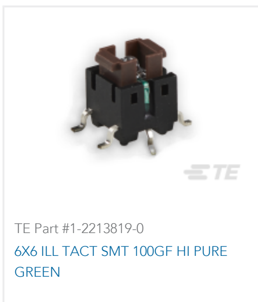
TE Part #1-2213819-0 6X6 ILL TACT SMT 100GF HI PURE GREEN