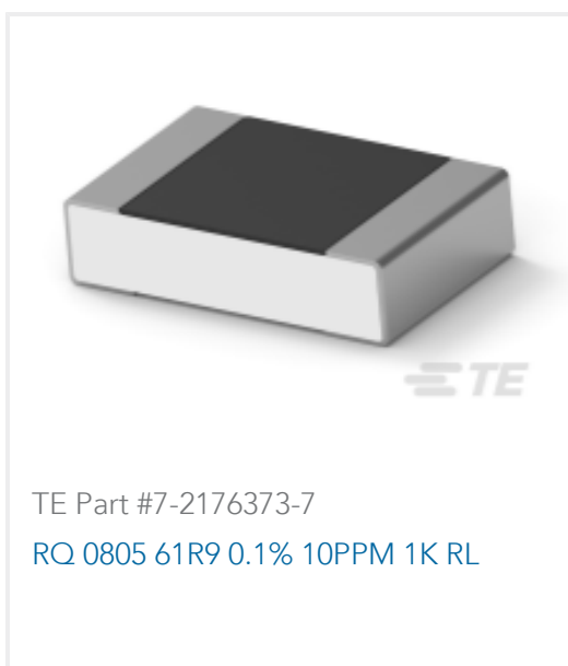
TE Part #7-2176373-7 RQ 0805 61R9 0.1% 10PPM 1K RL