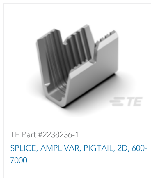
TE Part #2238236-1 SPLICE, AMPLIVAR, PIGTAIL, 2D, 600-7000