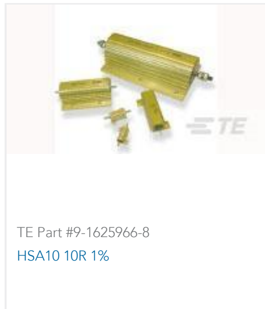
TE Part #9-1625966-8 HSA10 10R 1%