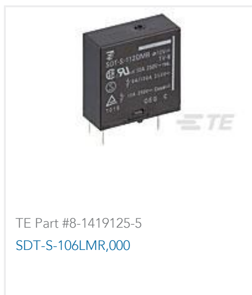
TE Part #8-1419125-5 SDT-S-106LMR,000