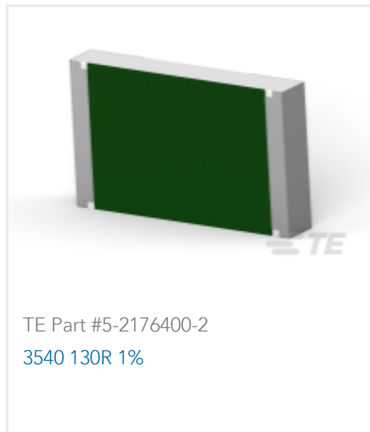
TE Part #5-2176400-2 3540 130R 1%