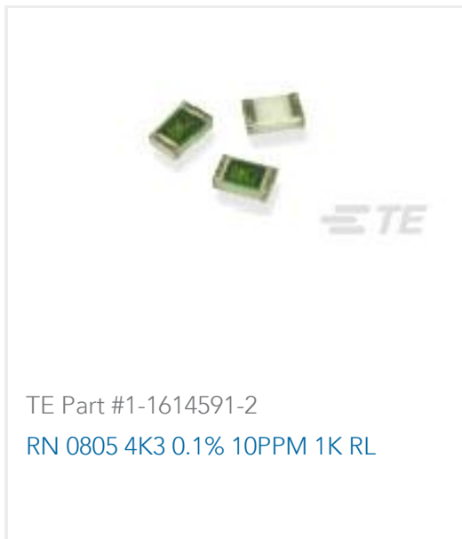
TE Part #1-1614591-2 RN 0805 4K3 0.1% 10PPM 1K RL