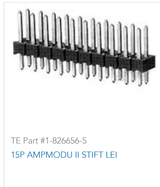
TE Part #1-826656-5 15P AMPMODU II STIFT LEI