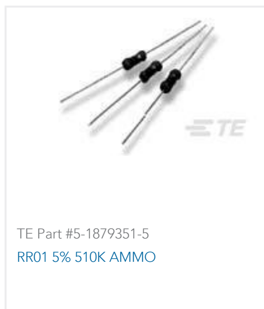
TE Part #5-1879351-5 RR01 5% 510K AMMO