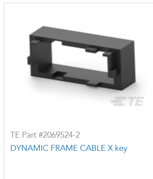
TE Part #2069524-2 DYNAMIC FRAME CABLE X key