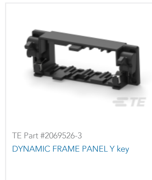
TE Part #2069526-3 DYNAMIC FRAME PANEL Y key