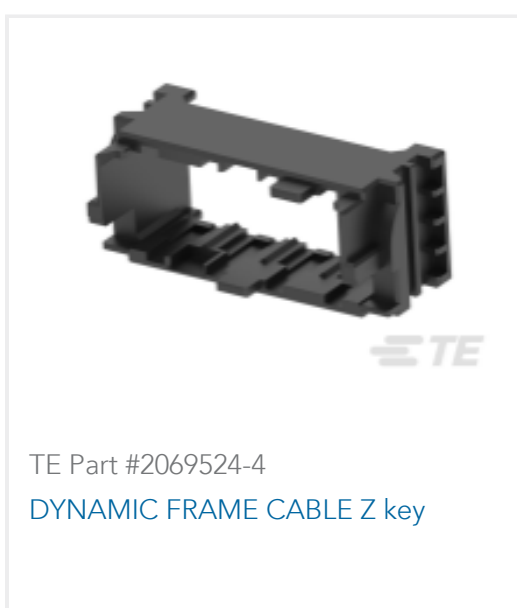
TE Part #2069524-4 DYNAMIC FRAME CABLE Z key