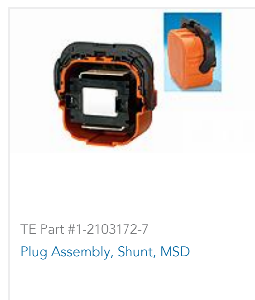
TE Part #1-2103172-7 Plug Assembly, Shunt, MSD