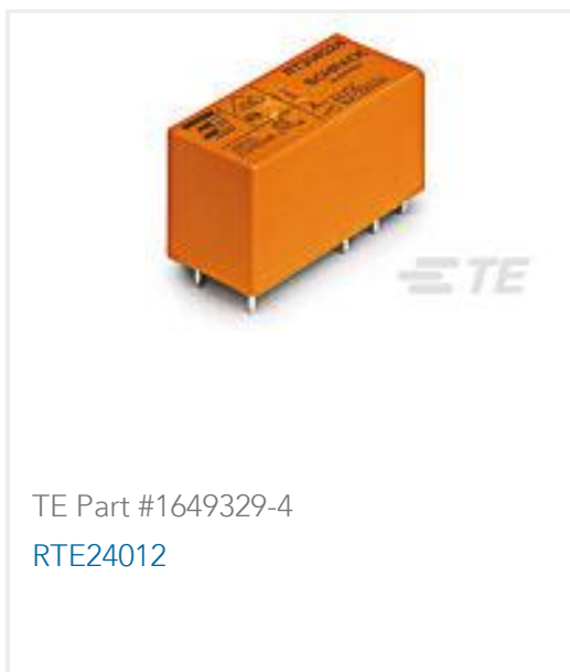
TE Part #1649329-4 RTE24012