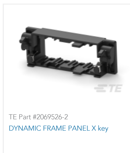
TE Part #2069526-2 DYNAMIC FRAME PANEL X key