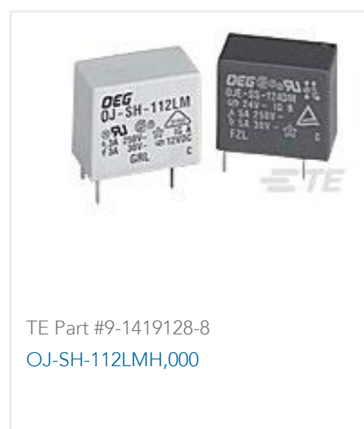
TE Part #9-1419128-8 OJ-SH-112LMH,000