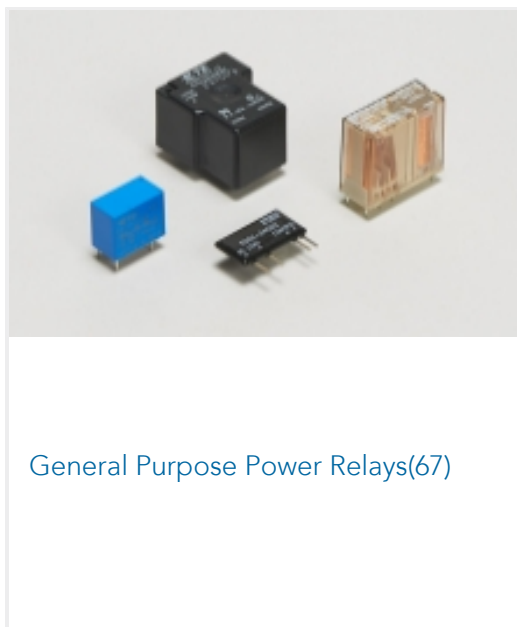
General Purpose Power Relays(67)