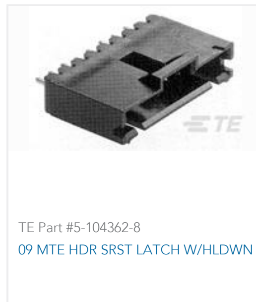
TE Part #5-104362-8 09 MTE HDR SRST LATCH W/HLDWN