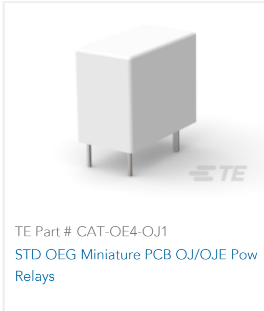
TE Part # CAT-OE4-OJ1 STD OEG Miniature PCB OJ/OJE Pow Relays