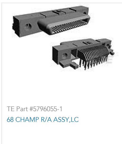
TE Part #5796055-1 68 CHAMP R/A ASSY,LC