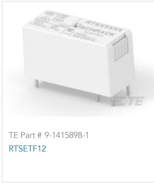
TE Part # 9-1415898-1 RTSETF12