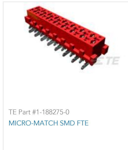
TE Part #1-188275-0 MICRO-MATCH SMD FTE