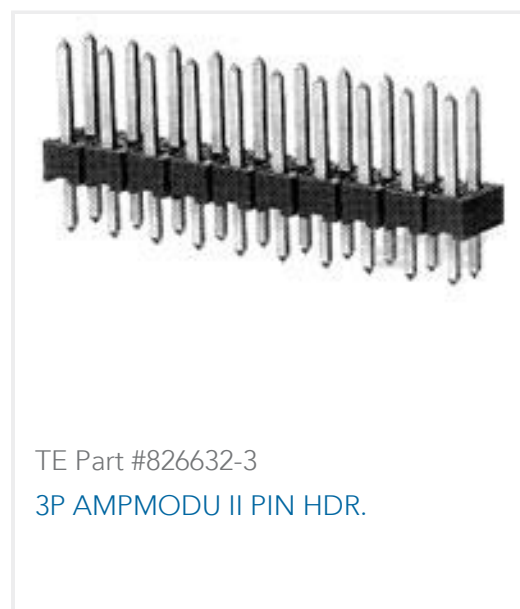
TE Part #826632-3 3P AMPMODU II PIN HDR.