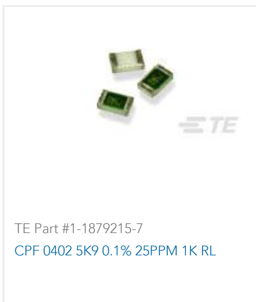
TE Part #1-1879215-7 CPF 0402 5K9 0.1% 25PPM 1K RL