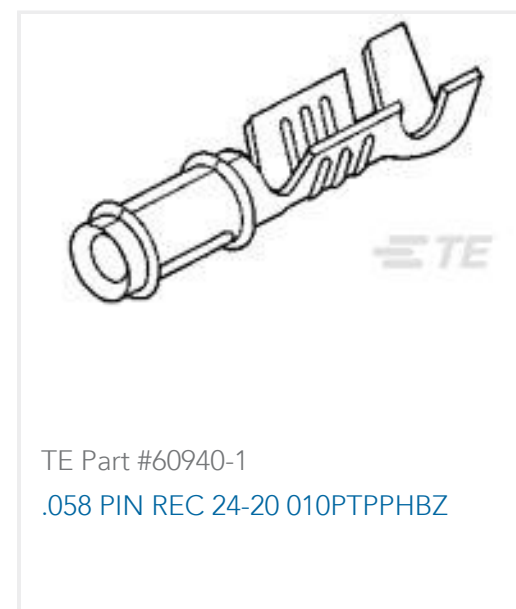
TE Part #60940-1 .058 PIN REC 24-20 010PTPPHBZ