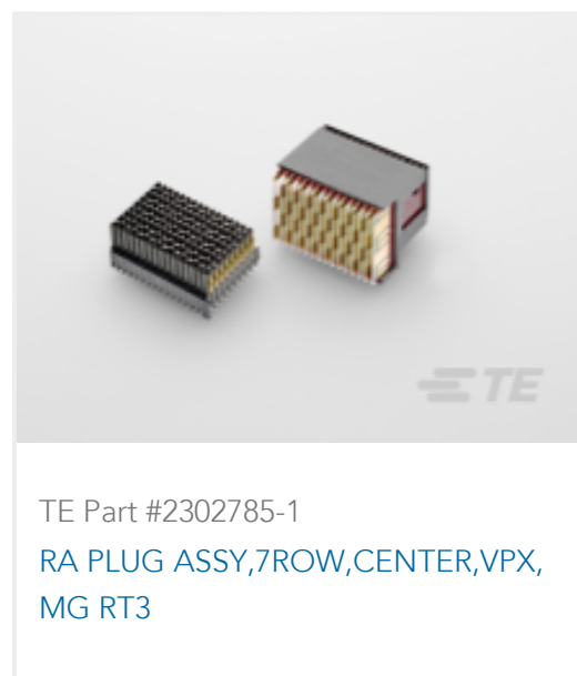
TE Part #2302785-1 RA PLUG ASSY,7ROW,CENTER,VPX, MG RT3