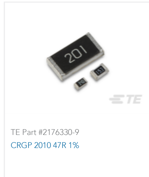
TE Part #2176330-9 CRGP 2010 47R 1%