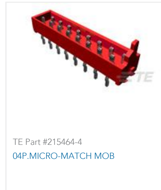
TE Part #215464-4 04P.MICRO-MATCH MOB