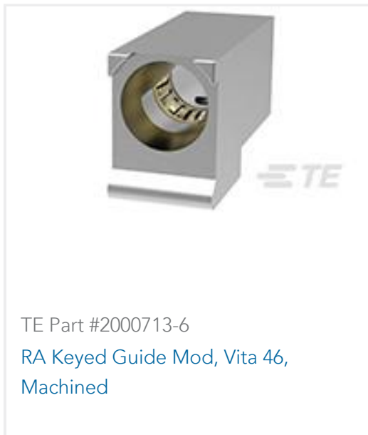
TE Part #2000713-6 RA Keyed Guide Mod, Vita 46, Machined