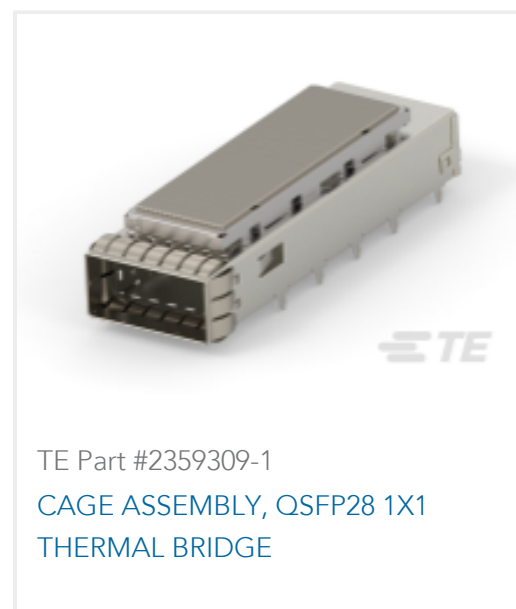
TE Part #2359309-1 CAGE ASSEMBLY, QSFP28 1X1 THERMAL BRIDGE