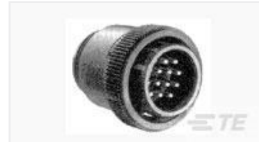
TE Part #206305-1 CPC PLUG ASSEMBLY SIZE 23-37