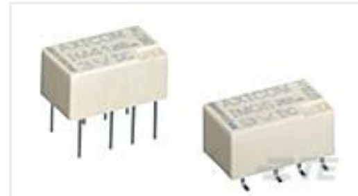
TE Part #4-1462037-7 IM07GR=IM RELAY 200mW 24VDC