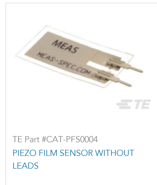
TE Part #CAT-PFS0004 PIEZO FILM SENSOR WITHOUT LEADS