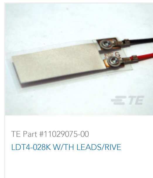
TE Part #11029075-00 LDT4-028K W/TH LEADS/RIVE