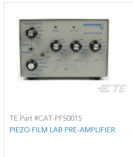
TE Part #CAT-PFS0015 PIEZO FILM LAB PRE-AMPLIFIER