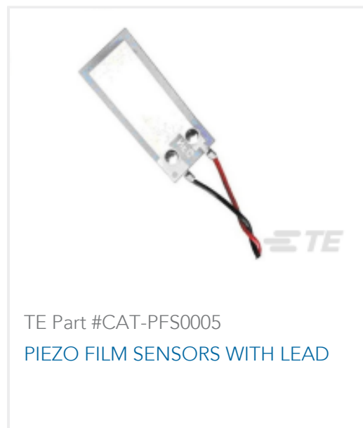
TE Part #CAT-PFS0005 PIEZO FILM SENSORS WITH LEAD