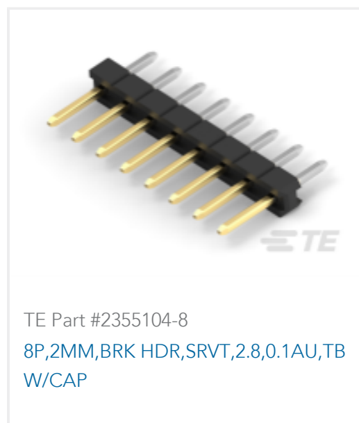
TE Part #2355104-8 8P,2MM,BRK HDR,SRVT,2,8,0.1AU,TB W/CAP