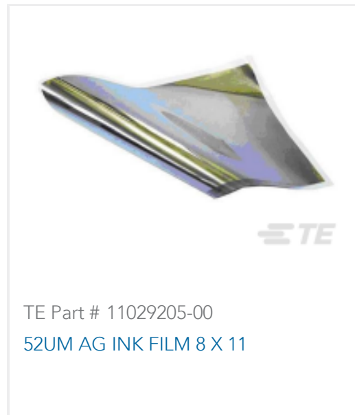
TE Part # 11029205-00 52UM AG INK FILM 8 X 11