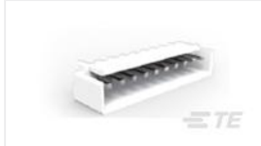
TE Part #1744427-7 EP Header Asy,Shrouded,7 Pos, GW