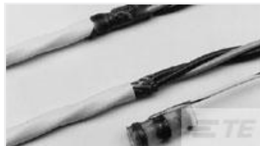
TE Part #403289-000 CWT-3