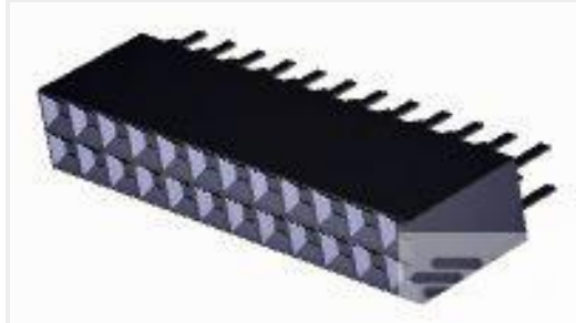
TE Part #1-534998-2 24 MODIV VRT DR CE 100/125