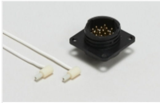
Circular Power Connectors(211)