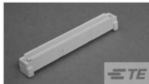
TE Part #5179030-6 0.8FH,P07H.5,140,08/Sn,TU