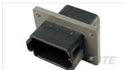
TE Part #DT04-12PB-L012 REC, 12P, BLK, N, FLANGE, B