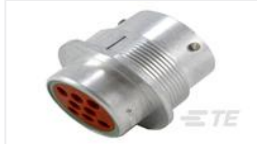
TE Part #HD34-18-8SN REC, 8P, AL, N, 12, S