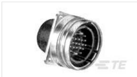
TE Part #208481-1 CMC RECPT ASSEMBLY SIZE 28