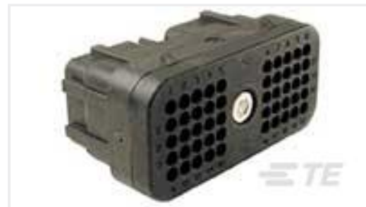
TE Part #DRC26-50S04 PLG, 50P, BLK, N, 04