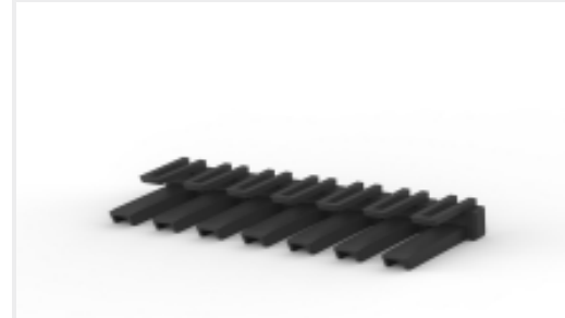
TE Part #1744544-7 EP II TPA 07P, BLACK