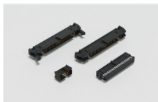
Ribbon Cable Connectors(183)