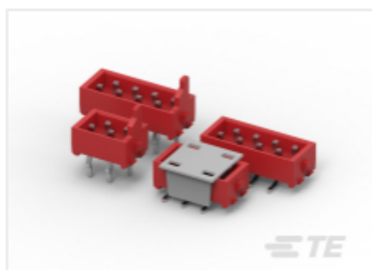
TE Part # CAT-M5833-M2934 Male-on-Board Connector, Micro-MaTch