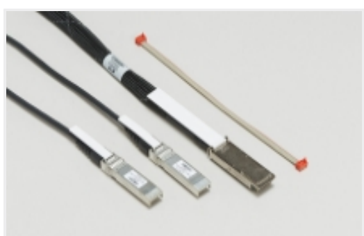
Pluggable I/O Cable Assemblies(52)