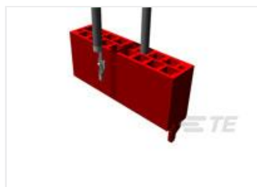
TE Part # 1-338095-2 MICRO-MATCH COSIHSG