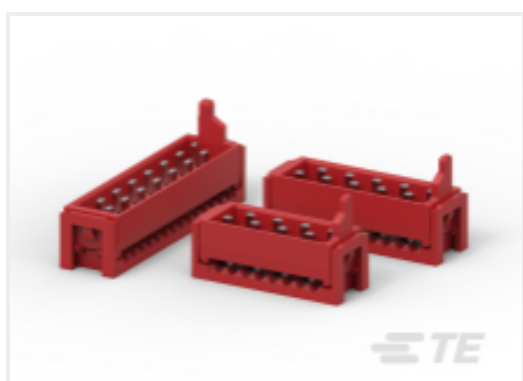
TE Part # CAT-M5833-M2934A Male-on-Wire Connector, Micro-MaTch