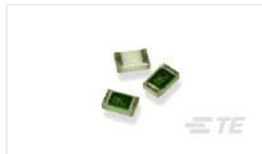
TE Part #3-1879215-6 CPF 0402 9K53 0.1% 25PPM 1K RL