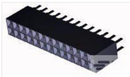
TE Part #1-534206-3 26 MODII VRT DR CE 100/115