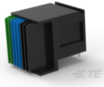
TE Part #1410189-4 MULTIGIG RT T2 7RW H-LFT,ET2