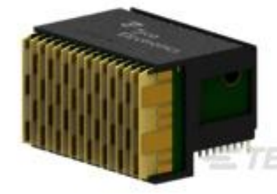
TE Part #1410187-4 MULTIGIG RT T2 7RW DC DF CT