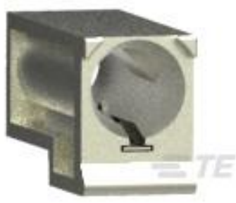
TE Part #1-1469492-8 MULTIGIG RT 9MM GUIDE/ESD 315 DEG