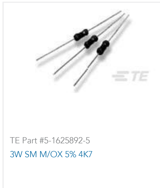
TE Part #5-1625892-5 3W SM M/OX 5% 4K7