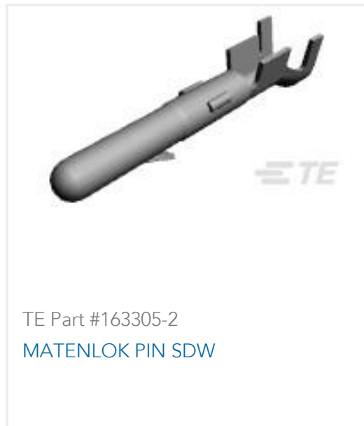
TE Part #163305-2 MATENLOK PIN SDW