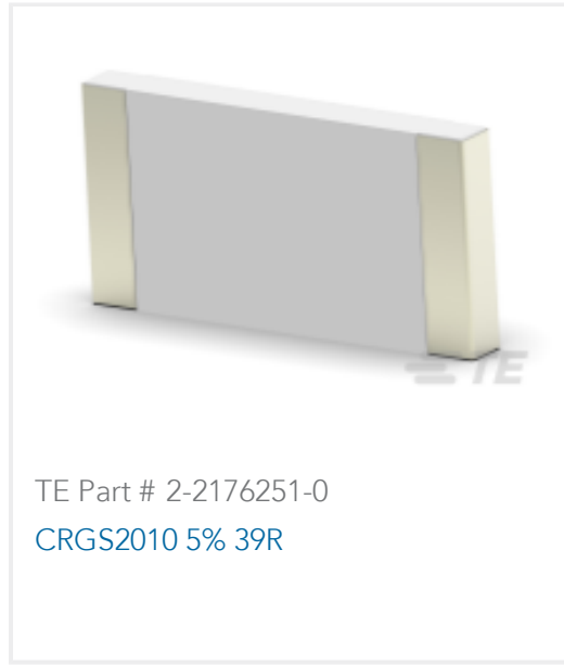
TE Part # 2-2176251-0 CRGS2010 5% 39R