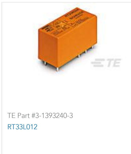
TE Part #3-1393240-3 RT33L012