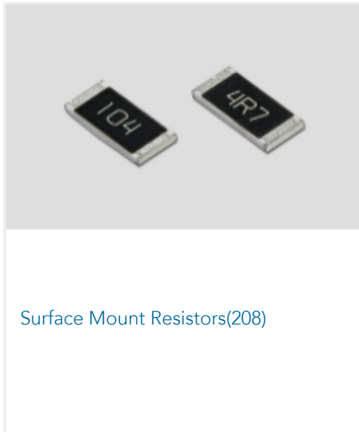
Surface Mount Resistors(208)