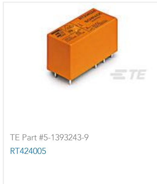
TE Part #5-1393243-9 RT424005