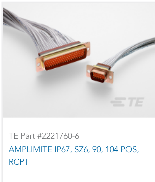
TE Part #2221760-6 AMPLIMITE IP67, SZ6, 90, 104 POS, RCPT