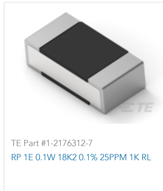
TE Part #1-2176312-7 RP 1E 0.1W 18K2 0.1% 25PPM 1K RL