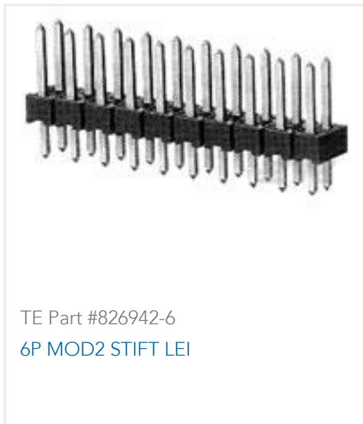
TE Part #826942-6 6P MOD2 STIFT LEI