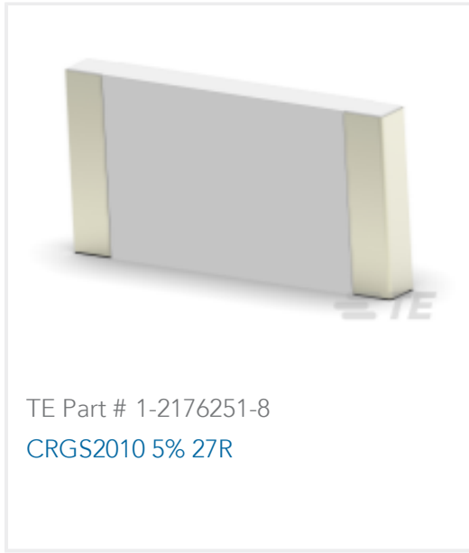
TE Part # 1-2176251-8 CRGS2010 5% 27R