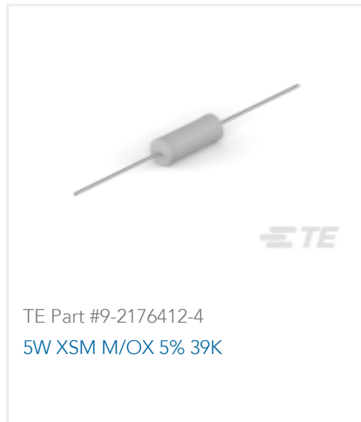
TE Part #9-2176412-4 5W XSM M/OX 5% 39K