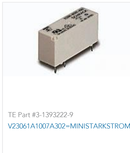
TE Part #3-1393222-9 V23061A1007A302=MINISTARKSTROM