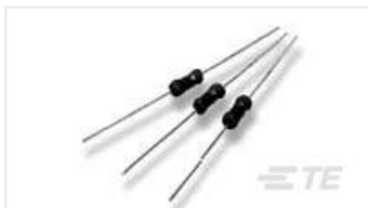
TE Part #1-1879355-6 RR03 5% 18K AMMO