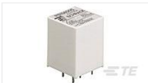
TE Part #7-1415356-1 PBH14009