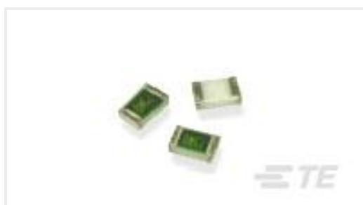
TE Part #9-2176091-0 RP 2A 0.25W 511R 0.1% 25PPM 1K RL