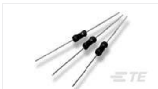
TE Part #2-1879355-5 RR03 5% 43K AMMO