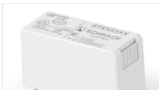
TE Part #2-1393239-9 RT134020