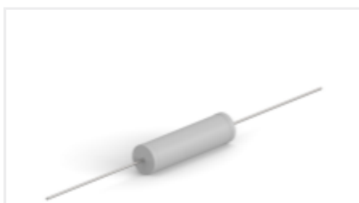
TE Part #5-2176414-1 7W STD M/OX 5% 2K4