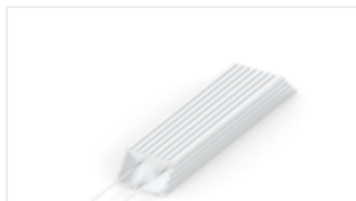
TE Part #2176504-8 CJP 100W 3R9 5% Lead