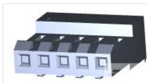
TE Part #3-640428-5 05P MTA156 CONN ASSY 22AWG RED