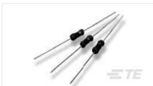
TE Part #1-1879355-5 RR03 5% 16K AMMO