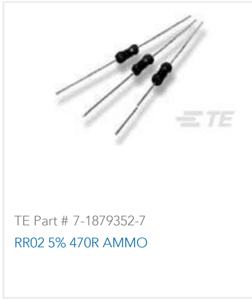
TE Part # 7-1879352-7 RR02 5% 470R AMMO