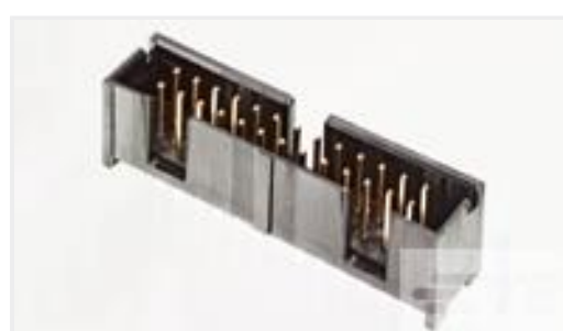
TE Part #5103308-8 A/L LOW PRO HDR 40P VERT BLACK