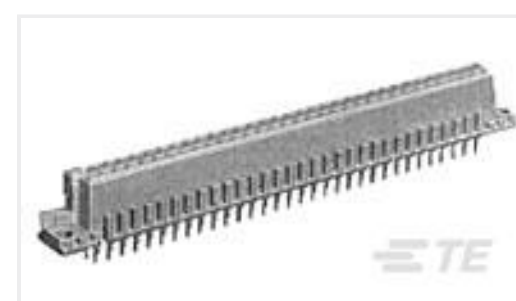
TE Part #5650858-5 ASSEMBLY,RECEPTACLE,EUROCARD, T