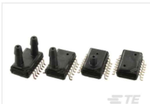
TE Part #5525DSO-DB001DS 1PSID DIGITAL PRESSURE SENSOR