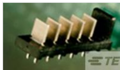
TE Part #5787444-1 HDR ASY,VERT,NO KEY,STR TAIL