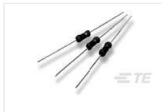
TE Part #2-1879355-4 RR03 5% 39K AMMO