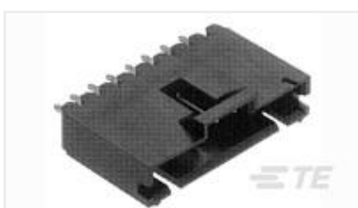
TE Part #5-103639-7 08 MTE HDR SRST LATCH .100CL