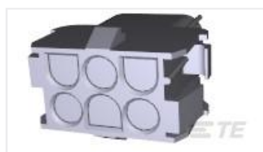
TE Part #2178773-1 UMNL 6 WAY CAP HOUSING