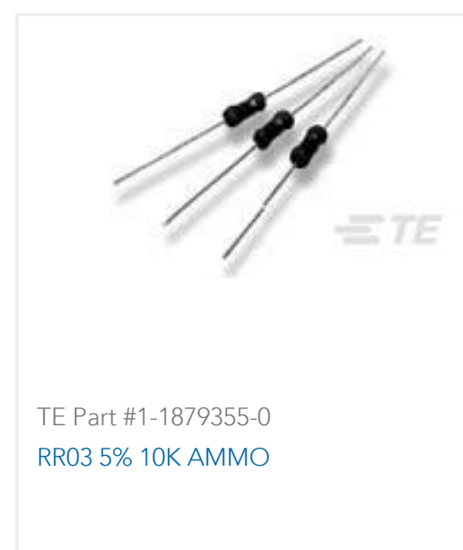
TE Part #1-1879355-0 RR03 5% 10K AMMO