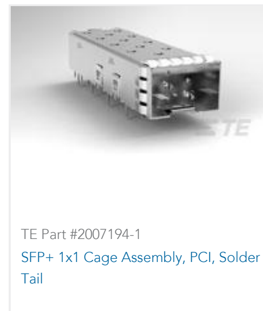
TE Part #2007194-1 SFP+ 1x1 Cage Assembly, PCI, Solder Tail