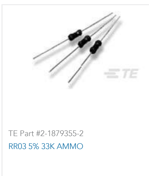
TE Part #2-1879355-2 RR03 5% 33K AMMO