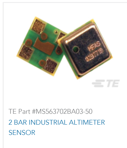
TE Part #MS563702BA03-50 2 BAR INDUSTRIAL ALTIMETER SENSOR