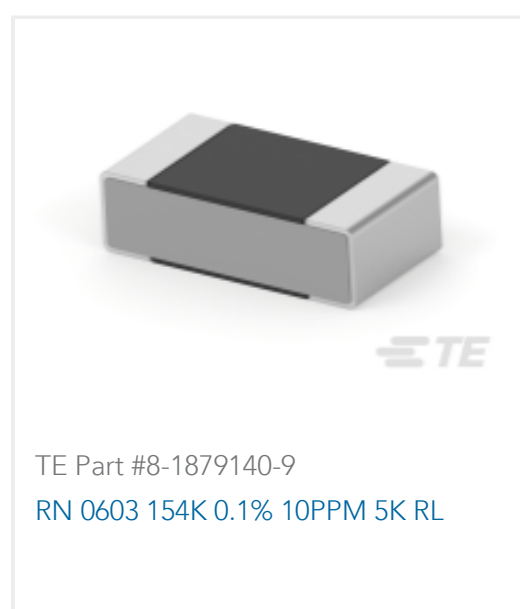
TE Part #8-1879140-9 RN 0603 154K 0.1% 10PPM 5K RL