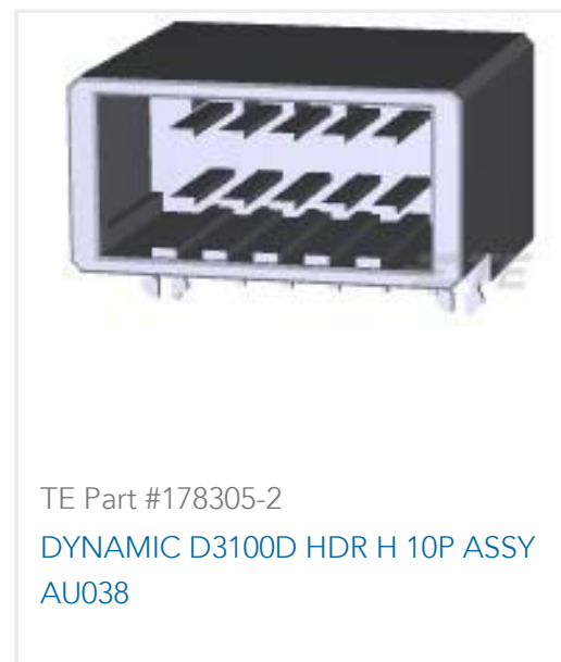
TE Part #178305-2 DYNAMIC D3100D HDR H 10P ASSY AU038