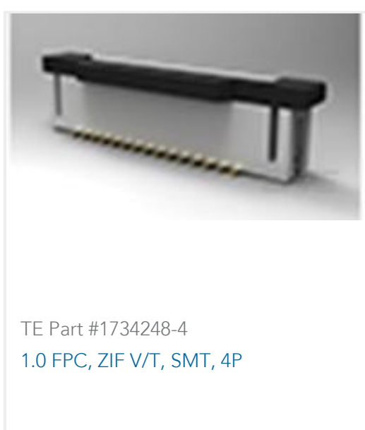
TE Part #1734248-4 1.0 FPC, ZIF V/T, SMT, 4P