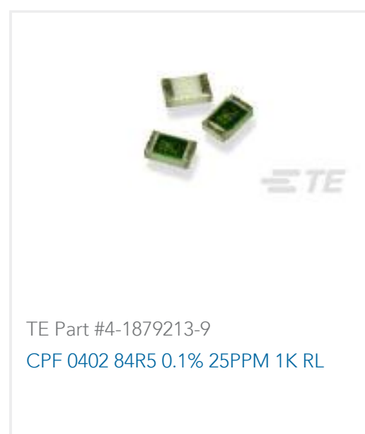
TE Part #4-1879213-9 CPF 0402 84R5 0.1% 25PPM 1K RL