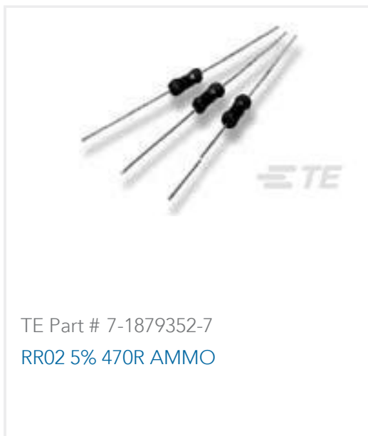
TE Part # 7-1879352-7 RR02 5% 470R AMMO