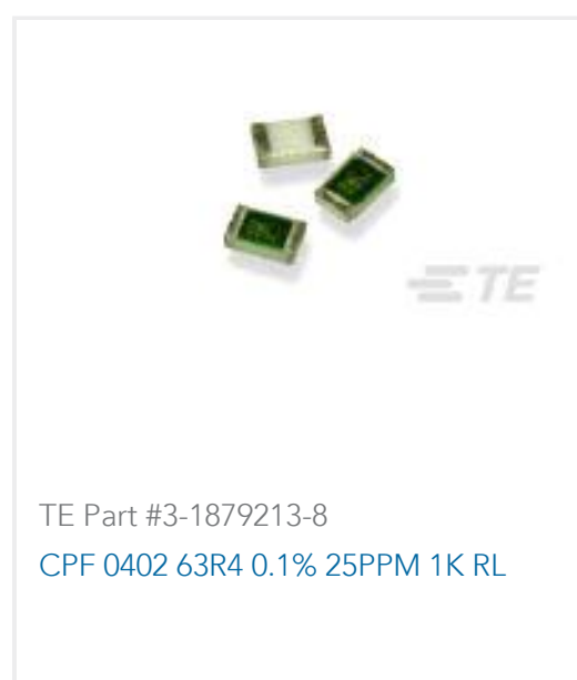
TE Part #3-1879213-8 CPF 0402 63R4 0.1% 25PPM 1K RL