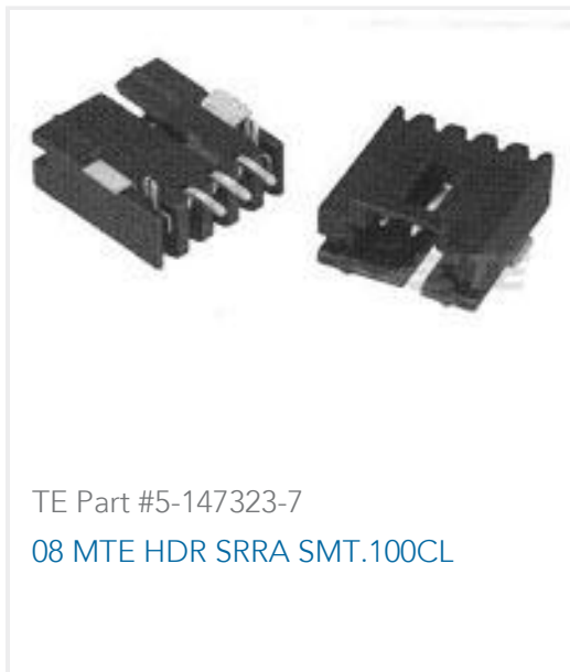
TE Part #5-147323-7 08 MTE HDR SRRA SMT.100CL