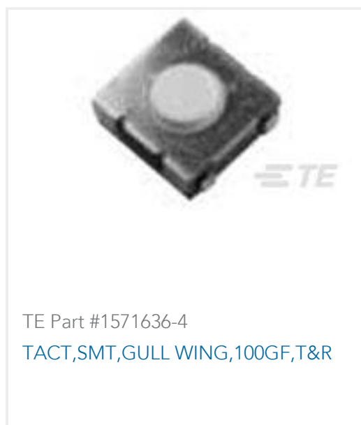
TE Part #1571636-4 TACT,SMT,GULL WING,100GF,T&R