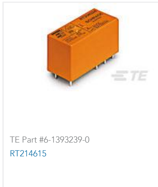
TE Part #6-1393239-0 RT214615