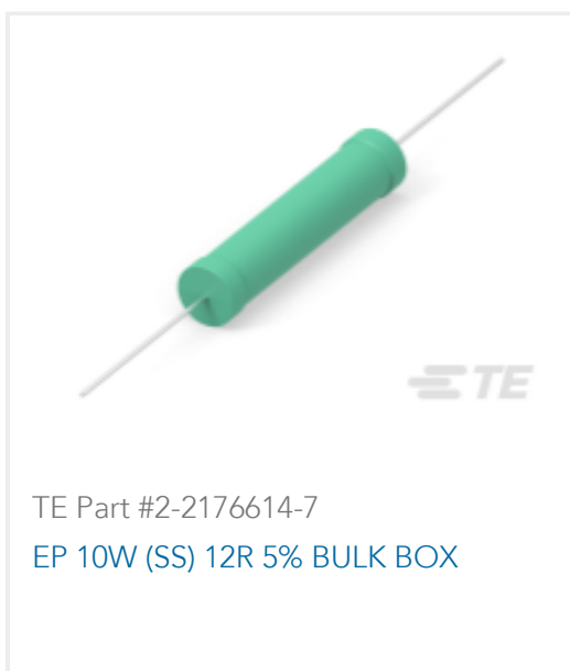
TE Part #2-2176614-7 EP 10W (SS) 12R 5% BULK BOX