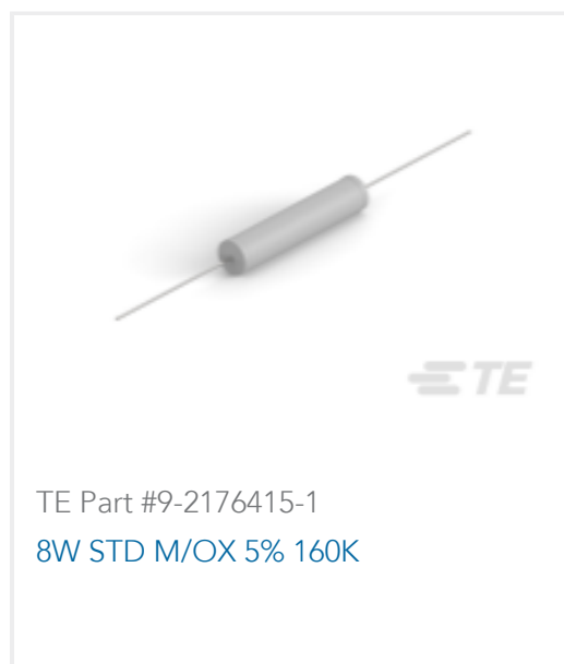
TE Part #9-2176415-1 8W STD M/OX 5% 160K