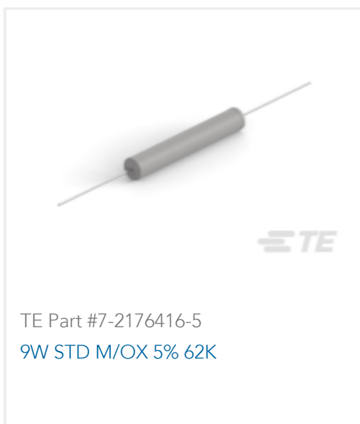
TE Part #7-2176416-5 9W STD M/OX 5% 62K