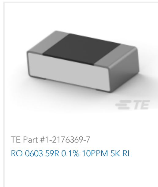
TE Part #1-2176369-7 RQ 0603 59R 0.1% 10PPM 5K RL