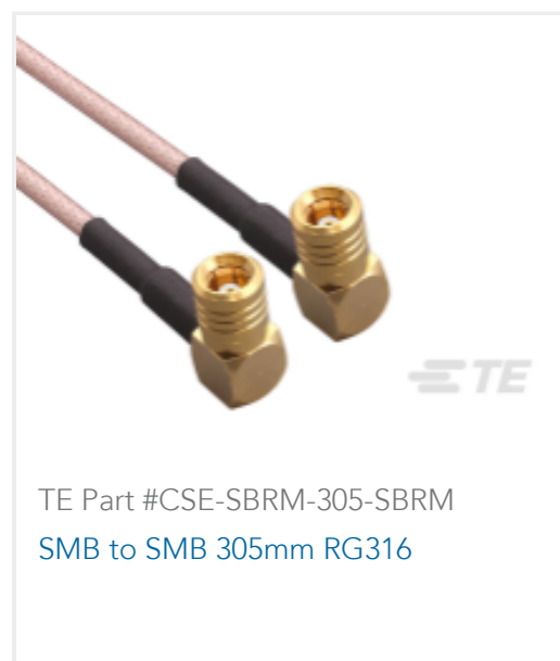
TE Part #CSE-SBRM-305-SBRM SMB to SMB 305mm RG316