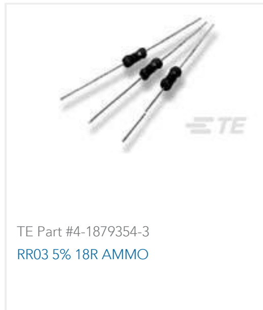
TE Part #4-1879354-3 RR03 5% 18R AMMO