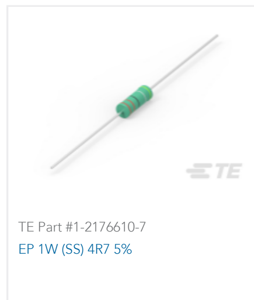
TE Part #1-2176610-7 EP 1W (SS) 4R7 5%