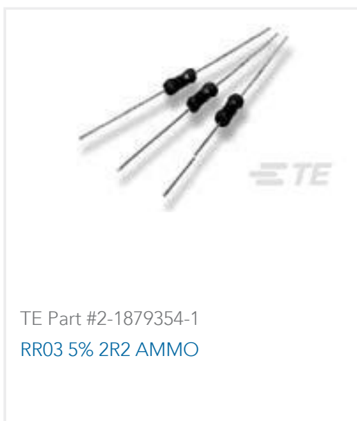
TE Part #2-1879354-1 RR03 5% 2R2 AMMO