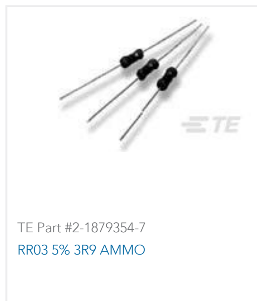
TE Part #2-1879354-7 RR03 5% 3R9 AMMO