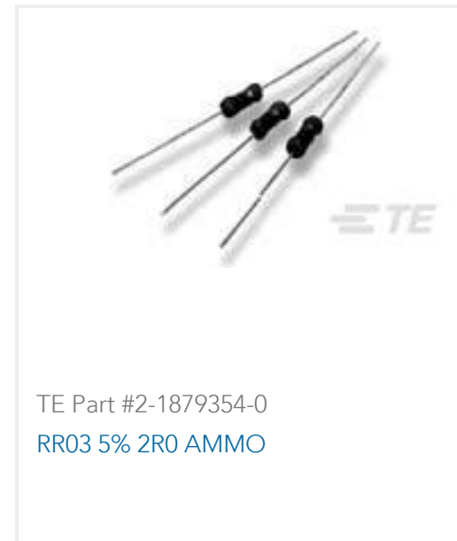
TE Part #2-1879354-0 RR03 5% 2R0 AMMO