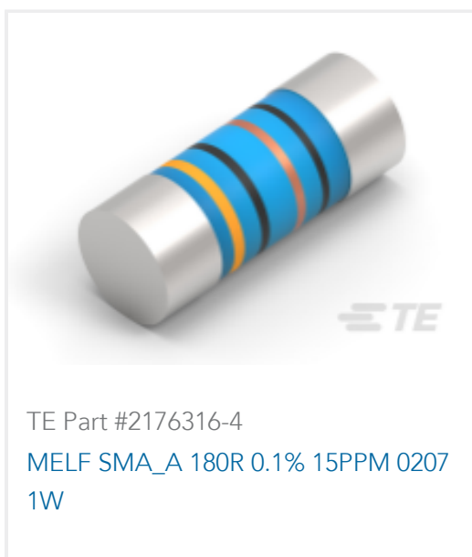
TE Part #2176316-4 MELF SMA_A 180R 0.1% 15PPM 0207 1W