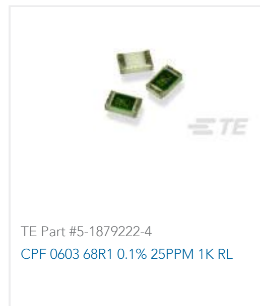
TE Part #5-1879222-4 CPF 0603 68R1 0.1% 25PPM 1K RL