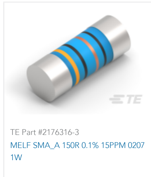
TE Part #2176316-3 MELF SMA_A 150R 0.1% 15PPM 0207 1W