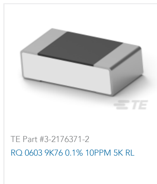
TE Part #3-2176371-2 RQ 0603 9K76 0.1% 10PPM 5K RL