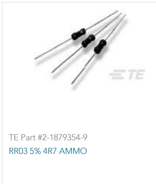
TE Part #2-1879354-9 RR03 5% 4R7 AMMO