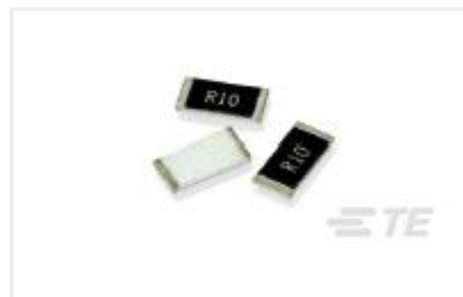
TE Part #2-1879463-2 RL73H 2E R75 1% 5K RL