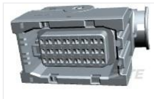
TE Part #4-1534127-1 AMP MCP 2.8 SOCKET HSG.,21POS. ASSY