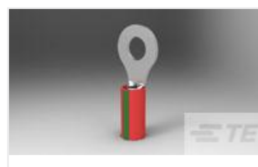
TE Part #2-320571-3 TERMINAL,PIDG R IR 22 1/4