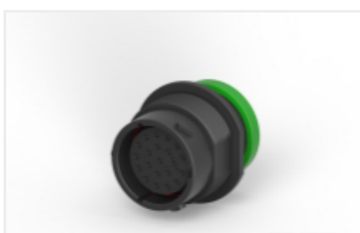
TE Part #HDP24-18-21SN-L017 REC, 21P, BLK, N, RNG, 20, S