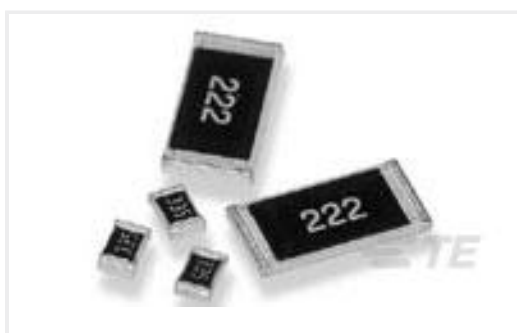
TE Part #5-1879501-7 CRGH2512 5% 220R 2W