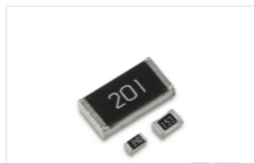
TE Part #3-2176327-4 CRGP 0805 5K6 1%