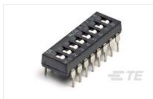
TE Part #1825002-1 ADF0204=DIP SWT,FLUSH,THRU/HL