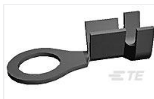
TE Part #41711 RING TERMINAL 22-18 AWG TPBR