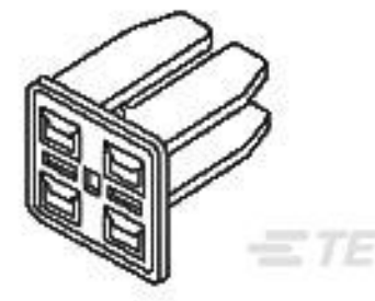
TE Part #1-174258-1 E-J MK-2 PLUG HSG 4P NATURAL