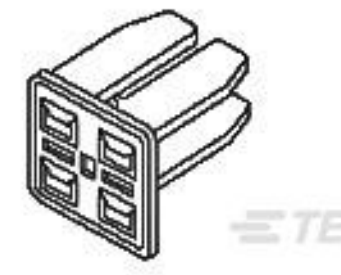
TE Part #1-174983-1 E-J MK-2 PLUG HSG 8P NATURAL