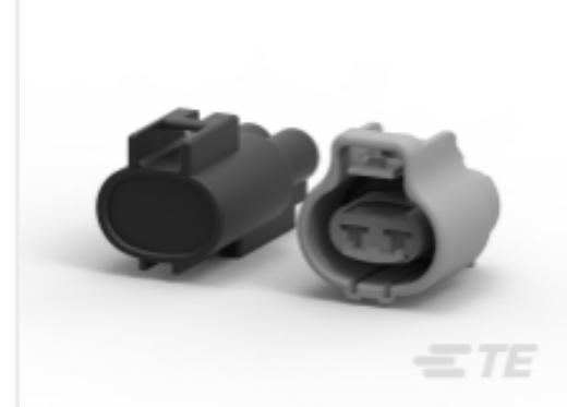
TE Part #CAT-EC7491-CH8172 ECONOSEAL, CONNECTOR HOUSING