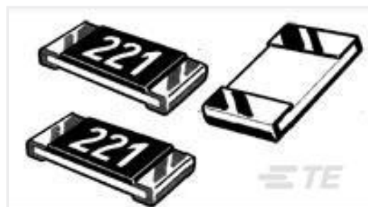
TE Part #5-2176230-3 3522 18K 5% 3W