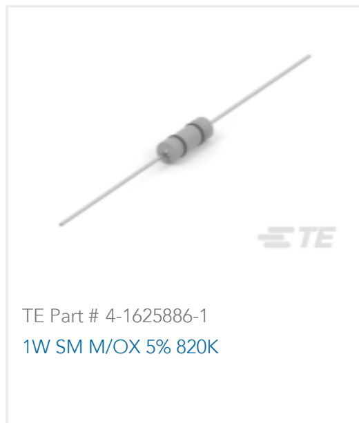
TE Part # 4-1625886-1 1W SM M/OX 5% 820K