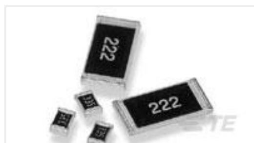
TE Part #1622917-1 CRG0603 1% 330K