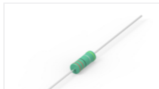
TE Part #4-2176611-1 EP 2W (SS) 47R 5%