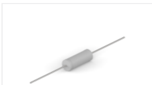
TE Part #8-2176412-8 5W XSM M/OX 5% 22K