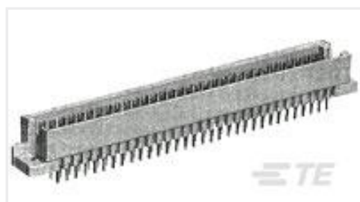
TE Part #5650936-5 ASSY,PIN,EUROCARD,TYPE R/2,LEAD-FREE,A&C