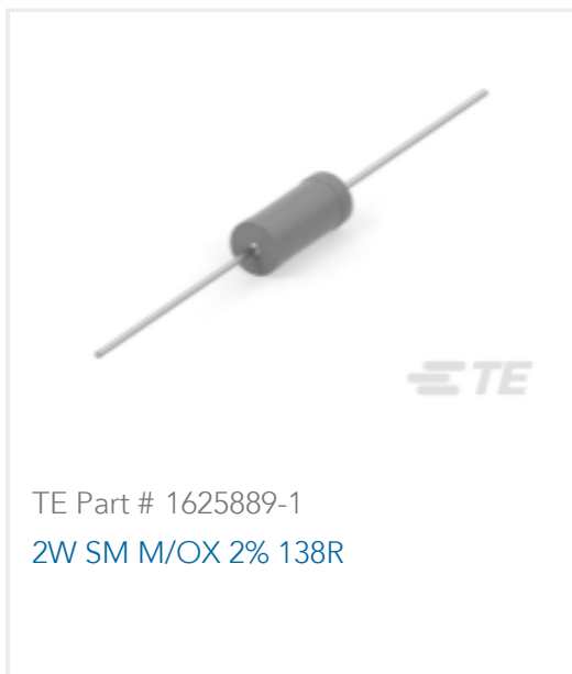
TE Part # 1625889-1 2W SM M/OX 2% 138R