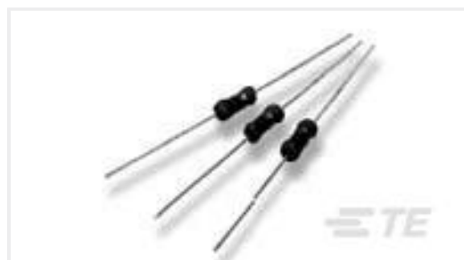
TE Part #4-1625892-5 3W SM M/OX 5% 39K