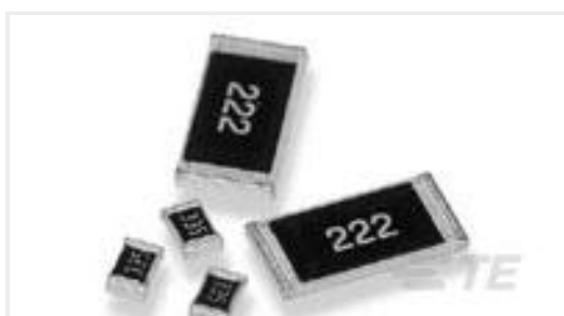
TE Part #3-1676480-1 CRG0402 1% 200R