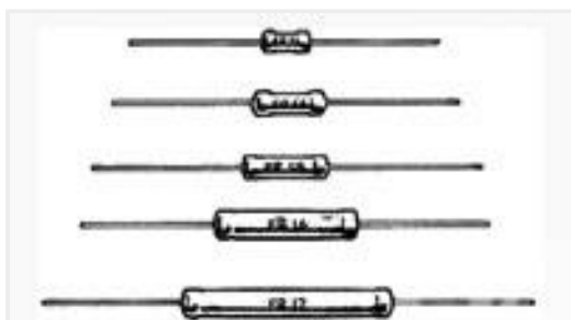
TE Part #2-1623750-5 ER58 47R 5% AMMO