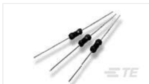
TE Part #7-1625890-0 2W SM M/OX 5% 82K