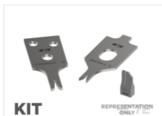
TE Part #7-2381607-7 OCEAN_2.0_SPARE_PART_KIT-203SP1730