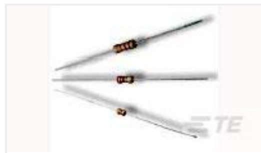
TE Part # 2-1623929-2 CFR200 5% 22K