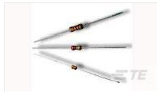
TE Part # 1623925-2 CFR100 5% 100R