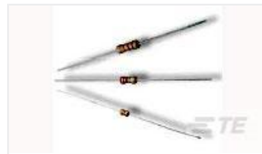
TE Part # 1623930-3 CFR25 5% 10K