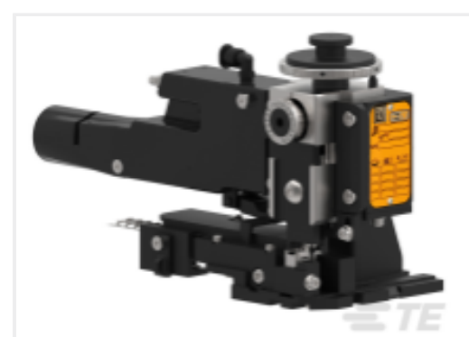
TE Part #2836365-2 OCEAN_2.0_Applicator-S-150O-SSA