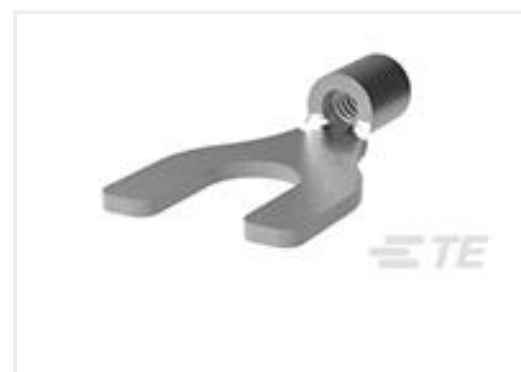
TE Part #2-34117-2 SOLIS SPD 22-16COMM 22-18MIL 8