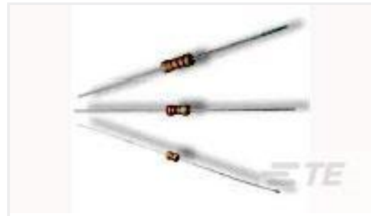
TE Part # 1623927-8 CFR16 5% 120R