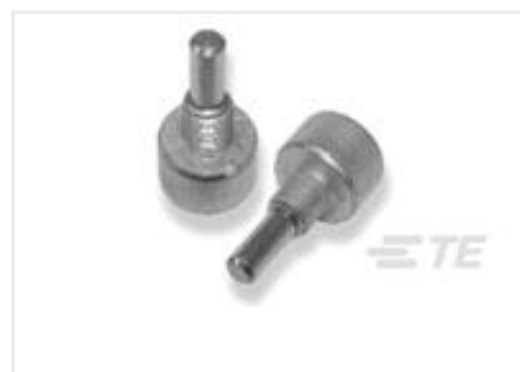
TE Part #2-1625931-9 MCU 2K2 10% 1" PL