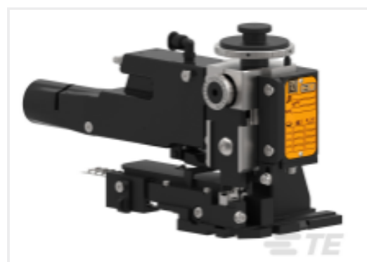
TE Part #2381607-2 OCEAN-2.0-APPLICATOR-S-203SP1730-SSA