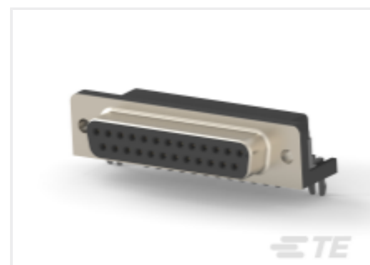
TE Part #2311762-1 AMPL REC, HD20, 25P, R/A THREADED, .318