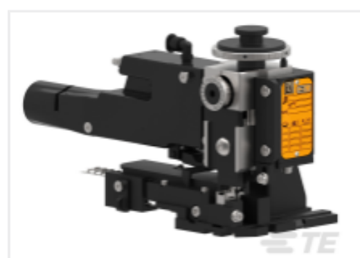
TE Part #2381609-2 OCEAN-2.0-APPLICATOR-S-203SP1730-SSA