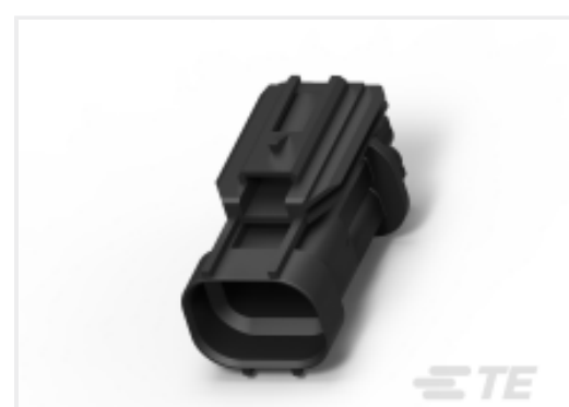
TE Part #1452324-3 TAB HOUSING 2.8MM, 4+6POS SEALED