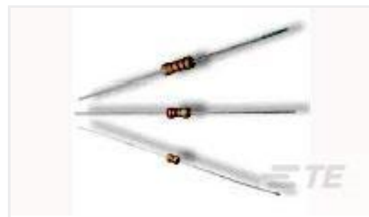
TE Part # 1623932-8 CFR50 5% 10K