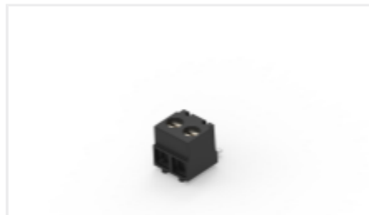
TE Part #2383941-2 TERMI-BLOK SMD MOUNT 180_2P_3, 81 MM 7A