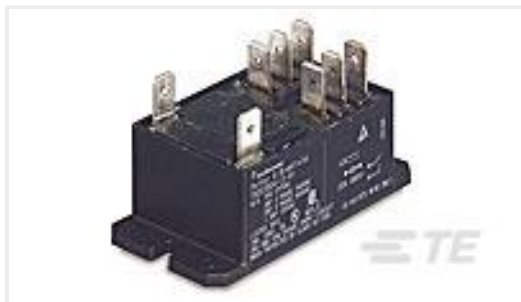
TE Part #7-1393211-1 T92P7D22-24