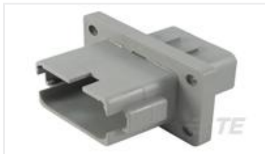
TE Part #DT04-12PA-BL04 REC, 12P, GRY, N, ENH KEY, FLANGE, A