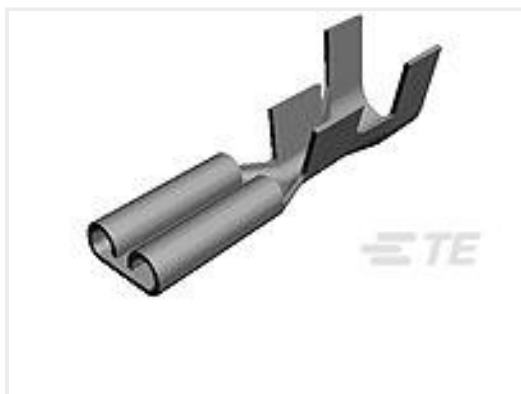
TE Part #42640-2 250 FASTON REC 22-18 AWG TPBR