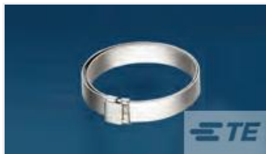
TE Part #CW2823-000 R85049/128-3