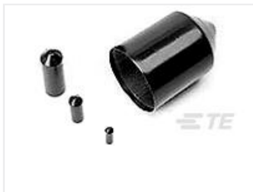
TE Part #843031-000 101A011-3-0