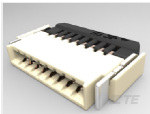
TE Part #2328702-8 8PIN 0.5MMP FPC CONNECTOR, BACK FLIP LOCK