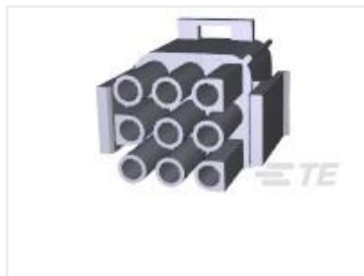
TE Part #1-480706-9 09P UMNL PLUG HSG BLK