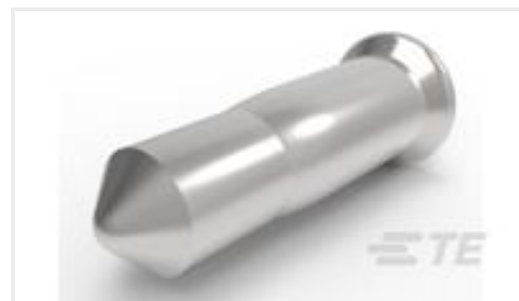
TE Part #5645522-1 MSS, SER 4, W/SEAL,SN-SN,STRIP