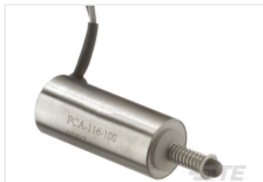
TE Part #02350531-000 GA-HD PCA-116-100 ASSY