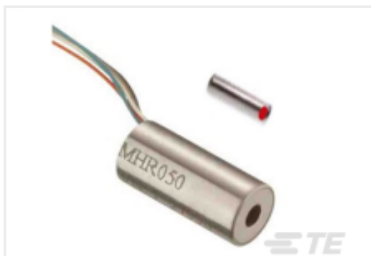
TE Part #02560408-000 LVDT MHR 050 ASSY