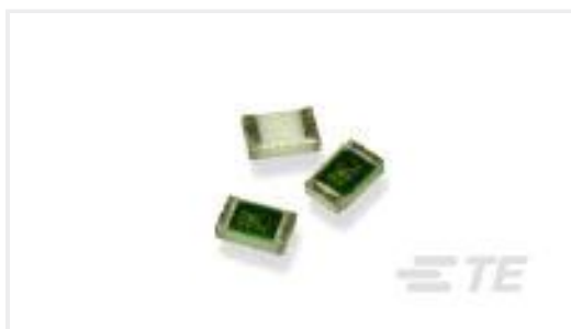
TE Part #7-1614892-8 CPF 0805 6K04 0.1% 25PPM 1K RL