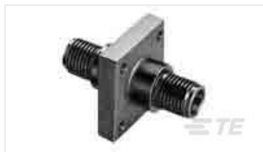
TE Part #858857-1 LGH-1/2L FLANGED RECEPT.