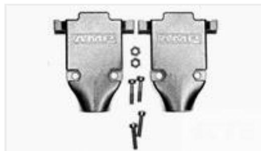
TE Part #5745171-2 SIZE 1 ASSY KIT .200