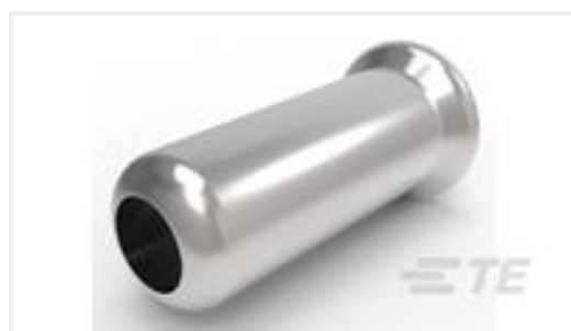
TE Part #5380635-5 REUSABLE COMP RCPT TN SPR8CUP