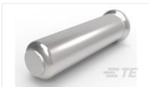
TE Part #3-5331272-5 SOCKET,MIN-SPR SN-AU SER-2