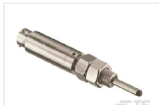
TE Part #02350510-000 GA-HD GCD-121-125 ASSY