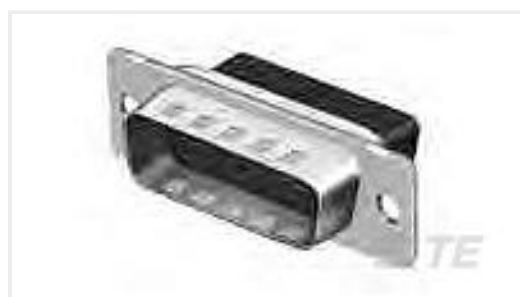
TE Part #207464-2 CRIMP SNAP PLUG ASSY,SZ 3