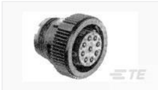
TE Part #205839-3 CPC PLUG ASSEMBLY SIZE 17-28