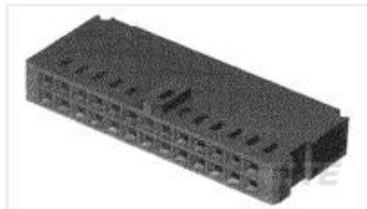
TE Part #1-102387-1 60 MODIV HSG COMP DR .100 POL