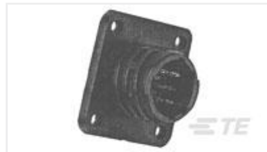
TE Part #205841-1 CPC RECPT ASSEMBLY SIZE 11-8