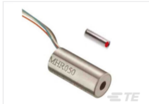
TE Part #02560406-000 LVDT MHR 010 ASSY