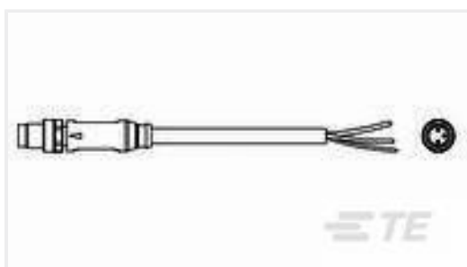
TE Part #1-2273004-3 M8 x 1.0 straight plug Pigtail Shld