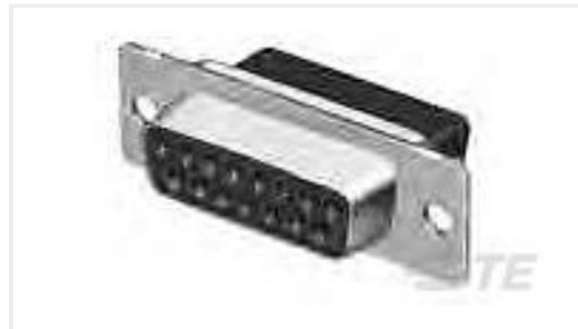
TE Part #205205-2 CRIMP SNAP RCPT ASSY,SIZE 2