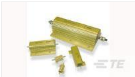
TE Part #2-1625999-1 HSC100 25R 5%