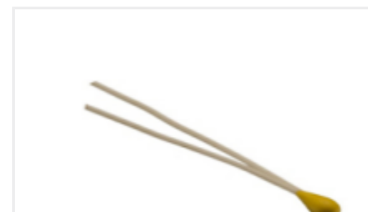
TE Part #GA10K3A11B DISCRETE 10K OHMS,+/-0.2C FROM 0C TO 70C