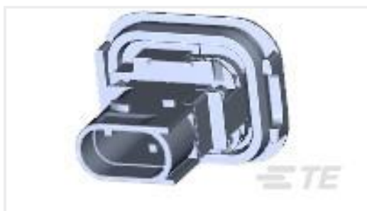
TE Part #1-1703841-1 2POS,TAB 2.8X0.8,TAB HSG,ASSY,