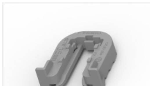
TE Part #1703838-6 SLIDE,TAB HSG GROUP A