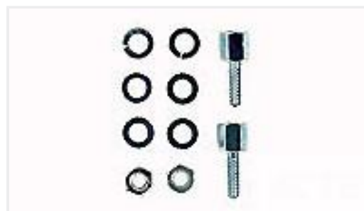
TE Part #5207719-3 KIT SCREWLOCK FEMALE CLEAR ZIN