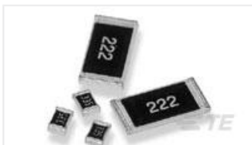
TE Part #1622829-1 CRG0603 1% 10K