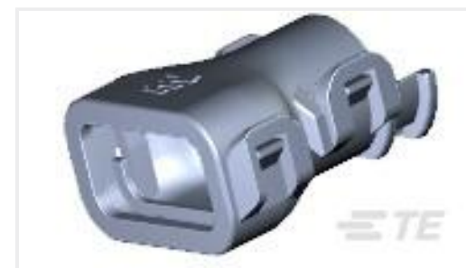
TE Part #1670365-1 COVER MIXED,180,2-3POS,BK